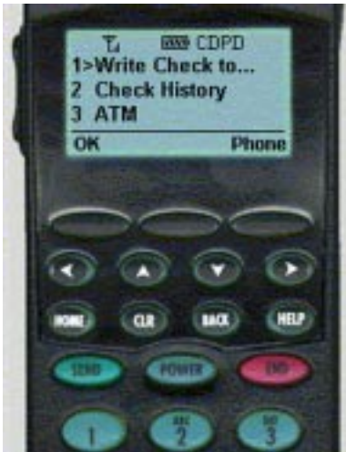
Fig. 3. Cell phone rendering.

appliance-independent language. But this would require Java to run on all appliances (which may never occur), and appliance-specific code (e.g., for layout) would be needed.