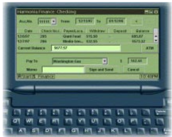
Fig. 2. Handheld PC rendering.

One answer is that existing languages were designed with inherent assumptions about the type of user interfaces and appliances for which they would be used. For example, HTML started as a language for describing documents (with tags for headings, paragraphs, and so on), and was augmented to describe forms. As another example, Javascript events correspond to a PC with a GUI, mouse, and keyboard. In theory, it is possible to modify languages to handle any type of appliance, but this produces a