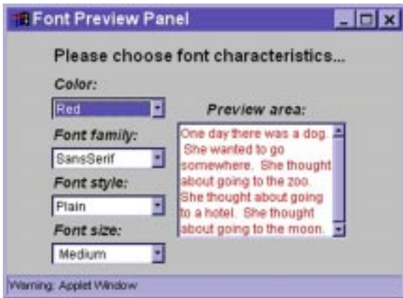
Fig. 5. Font panel; event handling is implemented entirely within UIML.

plex behavior, such as allowing buttons that change the appearance of the interface, without relying on procedural event handlers. For example, the font panel in Fig. 5 is implemented entirely in UIML without using procedural code (see uiml.org/papers/www8 for an example).