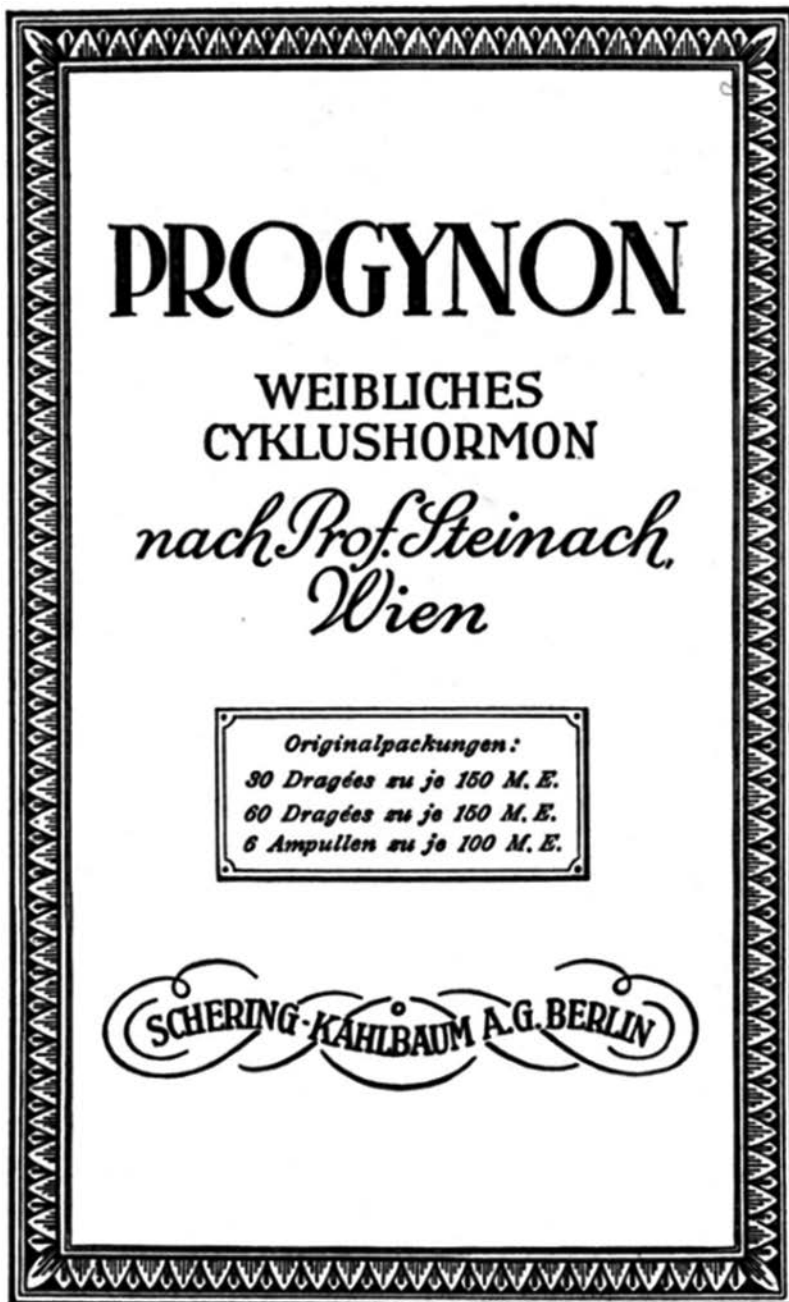
Figure 2. The ad used for the launch of Progynon by Schering in 1928.