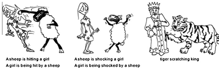
Fig. 1. Agent–patient ( hit ) and theme–experiencer ( shock ) verb prime items and target item ( scratch ).

alternating until all cards had been described. If the same picture appeared on both players up-turned card, the first player to shout “Snap” would win the cards in play. We tested adult participants using the same procedure and told them that the experiment was designed to test young children, hence the child-oriented nature of the task and materials. The experimental sessions were audio-recorded; participants’ responses were transcribed and scored according to the criteria outlined below. A second coder who was blind to condition independently scored 10% of the data; coder agreement was 97% (111/114 responses; Cohen’s k = 0.96 , p < .001 ).