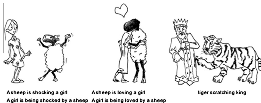
Fig. 2. Theme–experiencer ( shock ) and experiencer–theme ( love ) verb prime items and target item ( scratch ).

Experiment 2 used the same 2 (Prime) × 2 (Verb-Type) × 2 (Group) design as Experiment 1. We created an experiencer–theme verb version of the prime items using