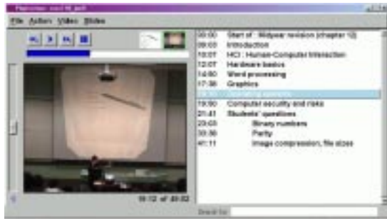
(a) Broad view of the theatre.