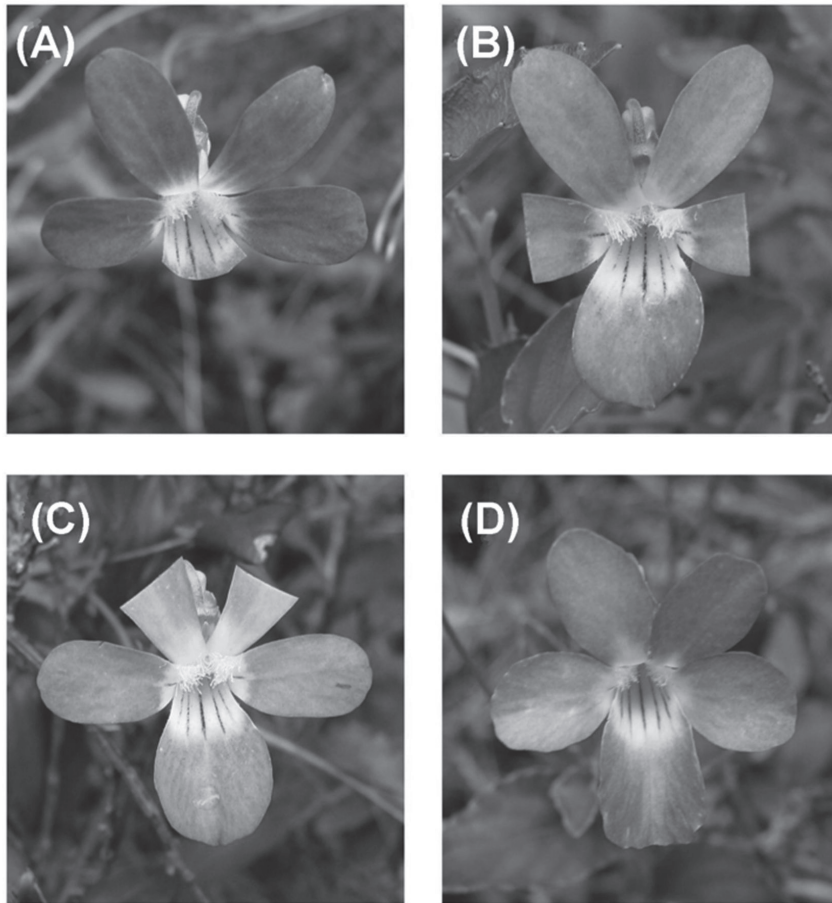
Fig. 1: Description of treatments applied to petals of Viola portalesia . A) Removal of the landing petal (T1), B) removal of the lateral petals (T2), C) removal of the upper petals (T3), D) control without petal removal (T4).

Descripción de los tratamientos aplicados a los pétalos de Viola portalesia . A) Remoción del pétalo de aterrizaje (T1), B) remoción de los pétalos laterales (T2), C) remoción de los pétalos superiores (T3), D) control sin remoción de pétalos (T4).