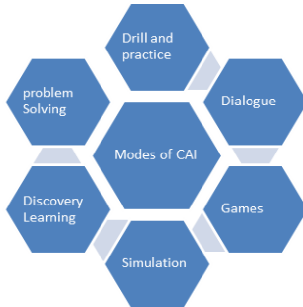
Figure 1. Different Modes of CAI

Traditionally, teachers have assumed that students learn science subjects through lectures, assignment reading, problem sets, and lab work. Yet we have all been frustrated by the frequent failure of our students to learn basic concepts of science. Because of the pace and large enrollment of many science courses, students are often not able to discuss and reflect on difficult materials. Evidence is mounting that these traditional methods are less effective than we once thought in helping our students to develop understanding of the science concepts that we are teaching (Siddiqui, 2005, p.250).