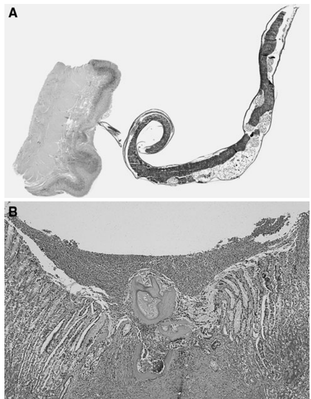
Fig. 2 Whole mount view of a single attached roundworm in the stomach in case 1 (a). Histology of the gastric mucosa demonstrating remnants of a roundworm with surrounding ulceration and erosion into superficial blood vessels (b). (Hematoxylin & eosin, \times 100 )

treatment. On admission he weighed 6.1 kg and was administered 400 ml of subcutaneous normal saline. The animal was noted to be breathing heavily through his mouth and making unusual sounds. In addition he