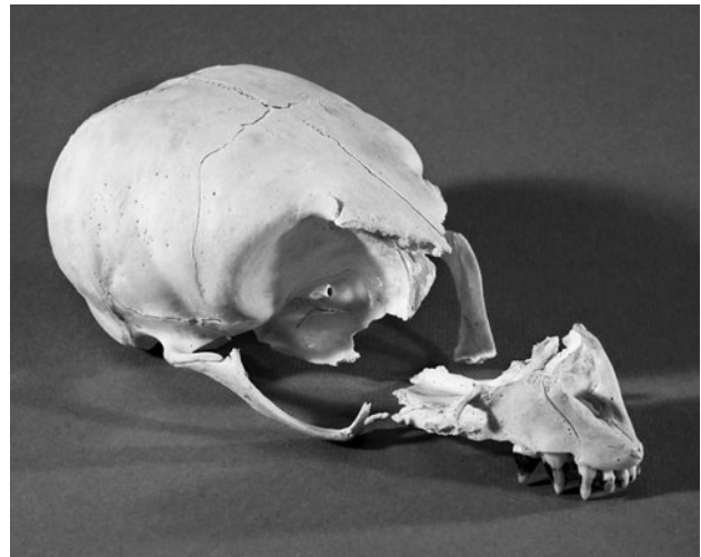
Fig. 4 Defleshed skull from case 2 showing loss of the mid facial skeleton due to comminuted fracturing

Dissection of soft tissues from the facial skeleton confirmed the presence of the facial fractures including fragments of shattered bone without evidence of recent hemorrhage. After defleshing the central facial skeleton collapsed. Irregular areas of reactive bone around the edges of the fractures were in keeping with osteomyelitis (Fig. 4). Death was therefore attributed to sepsis complicating