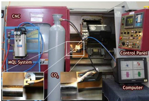
Fig. 1. The experimental setup.

AISI 316L was used for the purposes of this study. The experiment samples were rod-shaped, 130 mm in length and 25 mm in diameter. During the machining process, CNMG 12 04 08 mm cutting tips, produced by Sandvik company were used. The Johnford TC 35 CNC Fanuc OT, an x-z axis CNC machine was used during the experiment. A perhometer M1 type surface roughness meter, manufactured by Mahr was used in the experiment. Surface roughness can be determined with various parameters according to DIN, ISO, JIN, AISI standards. A KISTLER 9121 dynamometer with KISTLER 5019b type load amplifier and the DynoWare analysis software was used for power measurement during the experiments (Fig. 1).