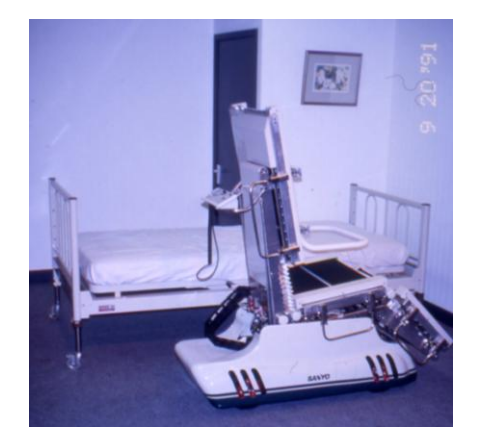
Figure 4: Service Robot, Lst: BRI, TUM

By service robots we refer to those mechatronic systems, which can be used for performing the particular set of home services like care services. These services can be performed by Robotic Systems in order to make disabled or older people's lives easier. These service robots can be guided through the overall home informatics network which communicating with the all relevant subsystems (See Figure 4). (Lst. BRI, Prof. Bock, 2009)