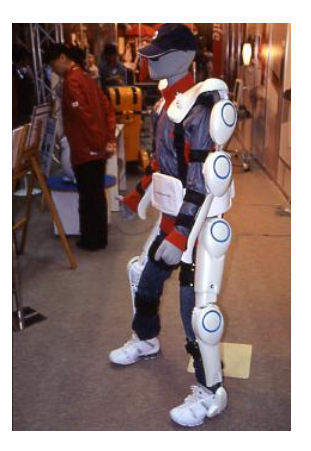
Figure 7: Exoskeleton, Lst: BRI, TUM