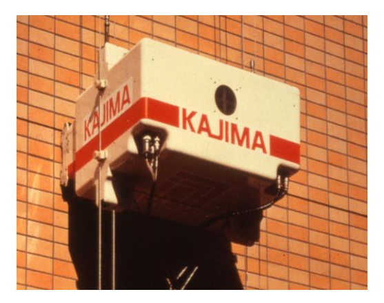
Figure 5: Maintenance Robot, Lst: BRI, TUM