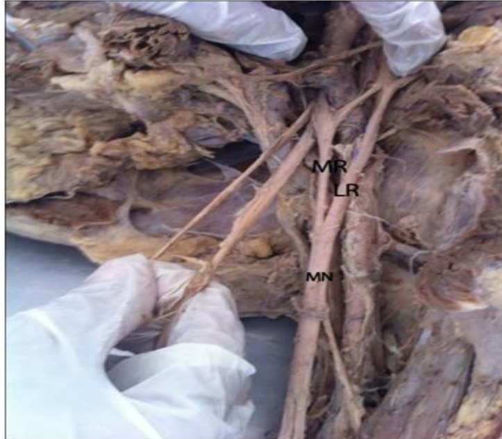
Figure 2: Dissection of left side axilla showing absence of Musculocutaneous nerve MR-Medial root of median nerve, LR-Lateral root of median nerve MN-Median nerve

Type I - No communication between median and musculocutaneous nerve