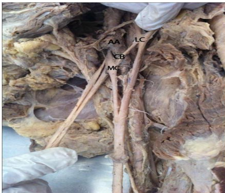
Figure 1: Dissection of left side axilla showing communicating branch between medial and lateral cord of brachial plexus MC- Medial Cord, LC- Lateral Cord, CB- Communicating Branch, AA-Axillary Artery

The muscular branch to biceps arose close to the distal end of coracobrachialis ran laterally and supplied the muscle. Another muscular branch ran between biceps and brachialis supplying the muscles and continued in the forearm as lateral cutaneous nerve of forearm (Fig.3). In the right side axilla, musculocutaneous nerve was seen to arise from lateral cord and there were two communications between musculocutaneous and median nerve. The musculocutaneous nerve after piercing coracobrachialis gave a large first communicating branch to median nerve which was 13.5 cm from the tip of coracoid process ran over the brachial artery and joined the median nerve at a distance of 17.5 cm from the same point. Another small second communicating branch arose from median nerve and ran over the brachial artery and behind the first communicating branch and joined the musculocutaneous nerve distal to first communicating branch (Fig. 4). The remaining trunk of musculocutaneous nerve continued as lateral cutaneous nerve of forearm. Median nerve did not supply any muscles in the right arm.