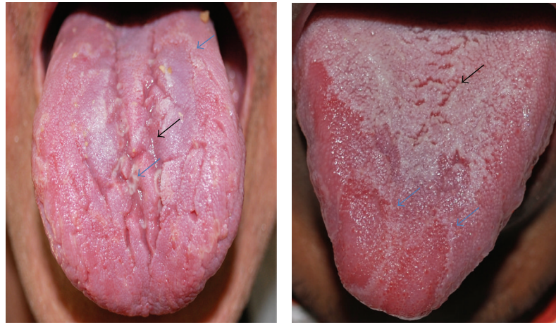
FIGURE 1: Fissured tongue and geographic tongue. Clinical aspects of fissured tongue (black arrow) and geographic tongue (blue arrow).