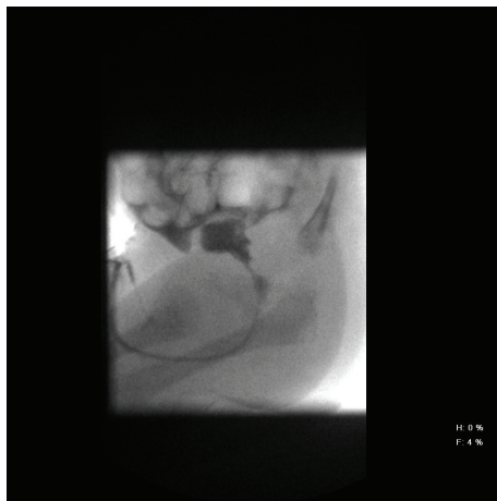
FIGURE 3: Water-soluble contrast administered via indwelling transurethral catheter. Spontaneous micturition on early filling (approximately 5 mL injected), with immediate extravasation of contrast into the peritoneal cavity. The study was therefore terminated, before the posterior urethra could be adequately evaluated. Bladder rupture is confirmed.

in any of them. One of the cases was a posterior urethral valve. Urinary ascites in posterior urethral valve can occur as a result of rupture of calyceal fornixes or transudation across the intact upper tract. It can also occur following the rupture of bladder wall. In obstructive uropathy, the upper tracts are subjected to high pressures in the intrauterine life. This affects the development of the kidneys and cystic renal dysplasia ensues. However, protective mechanisms do exist