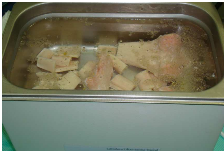
Fig. 5. Tissue's chemical processing. Ultrasonic clining with emulsifying solution.

adventitial tissue such as blood, periosteum, subcutaneous tissue, muscle, fascia and fibrotic tissue. Then, these tissues are immersed in emulsifying solutions based on hydrogen peroxide and alcohol under ultrasonic agitation (Figure 5).