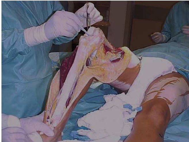
Fig. 2. Tissue removal: bone and tendon dissection under aseptic conditions.