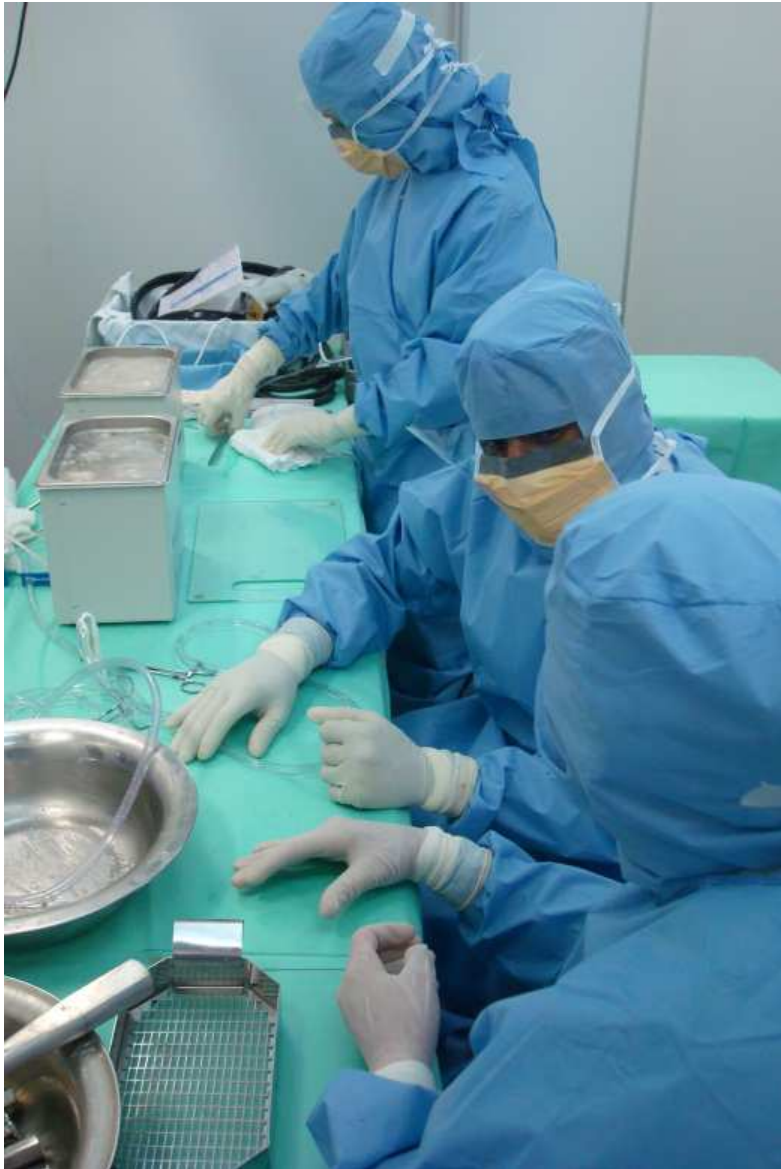
Fig. 4. Processing team in activity in the controlled área (ISO 5: Class 100).

of the nursing staff that performs the procedure, but also other professionals who access the environment (cleaning maintenance).