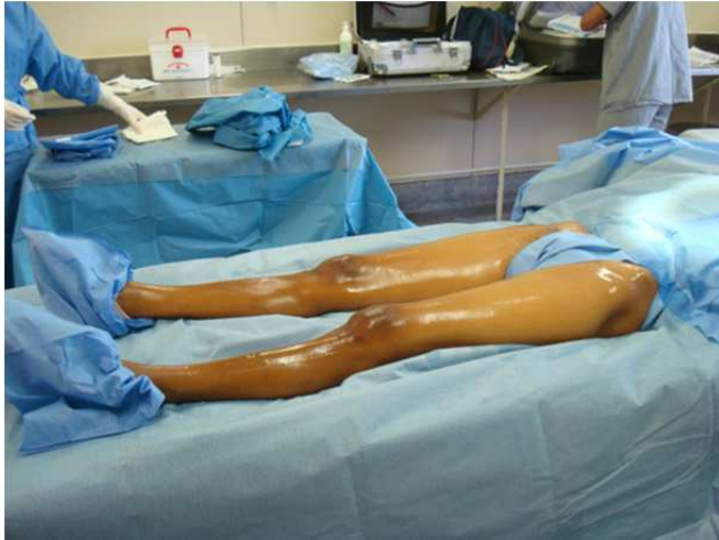
Fig. 1. Pre-operative preparation of the potential musculoskeletal tissues doner.

A very important step of the process of capture is the reconstruction of the donor and for this matter we use prosthesis specially designed using plaster, wire suture, gauze. This reconstruction is done rigorously and is characterized as the most laborious phase of the procedure. All anatomical parameters are respected, and therefore the deformation of the donor does not occur (Figures 1 and 2).