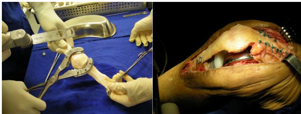
Fig. 6. and 7. Patellar tendon allograft transplant.

By the time of transplantation, all tissues processed are subjected to rigorous quality assurance criteria. It requires the evaluation of all data pertinent to the donor, test results, maintenance and control of equipment, materials and instruments used in all phases of each procedure (Figures 6 and 7).