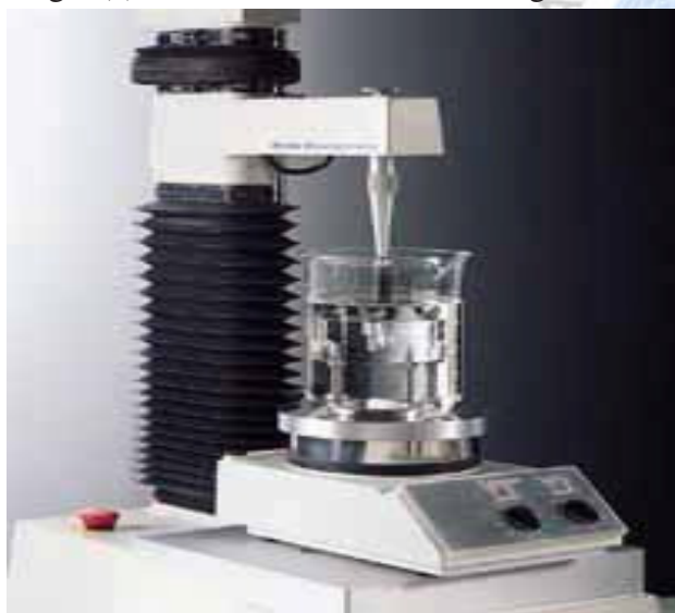
Fig. 1(b) Detachment stress measuring device

Pieces of sheep fundus tissue were stored frozen in saline solution and thawed to room temperature immediately before use. At the time of testing a section of tissue (E) was transferred, keeping the mucosal side out, to the upper glass vial (C) using a rubber band and an aluminum cap. The diameter of each exposed mucosal membrane was 1.1 cm. The vials with the fundus tissue were stored at 37°C for