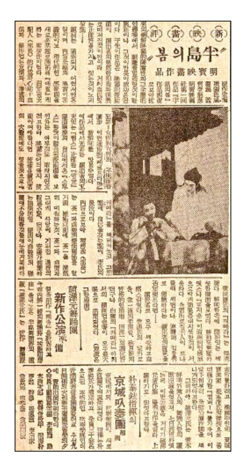
Figure 2: Review of Spring in the Korean Peninsula . On the same page is a feature celebrating the sacrifices of Korea's volunteer soldiers.