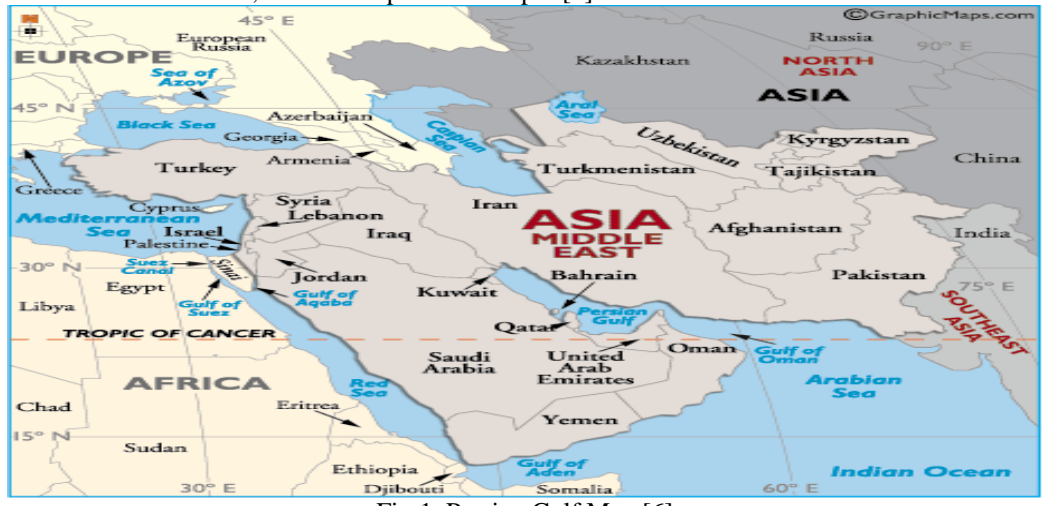
Fig.1. Persian Gulf Map [6]

With an area of 232850 km<sup>2</sup>, the Persian Gulf is located between Iran and the Arabian Peninsula (Fig.1) which is connected to the Gulf of Oman in the east by the Strait of Hormuz [6]. It has warm and salty shallow water. The Persian Gulf is an extension of the Indian Ocean into Iranian plateau in the south with an approximate length of 1000 kilometers, a width of 250 to 300 kilometers, and a maximum depth of 90 meters. The maximum wave height is 3 meters with a volume of 10 \times 13 cubic meters [9]. The Gulf's depth is not the same everywhere; in the northern parts it is relatively shallow, due to the sedimentation of the alluvium deposits of the rivers flowing to the Gulf, and in the central parts the depth does not exceed 40 or 50 meters. The deepest part is 93 meters deep in 15 kilometers off the cost of the Greater Tunb. Overall, the eastern parts are deeper [6].