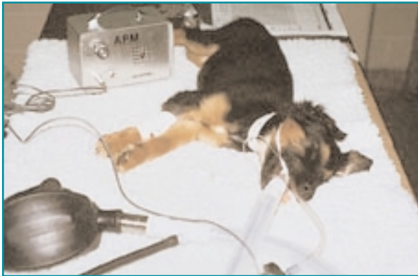
Figure 3 —An anesthetized pediatric gonadectomy patient is being monitored with an esophageal stethoscope, which is attached to an amplified speaker system for continuous auditory monitoring.