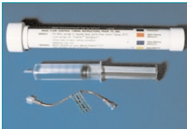
Figure 2 —Inexpensive mechanical syringe pump (Flowline™ Springfusor™—Mila International, Erlanger, KY). The syringe is filled with fluids and attached to specially made tubing that controls the flow rate, which ranges in intervals of 1.25 to 120 ml/hr. The syringe and attached tubing are then inserted into the spring-loaded syringe pump. The spring inside the syringe pump applies a constant pressure to the syringe plunger, and the flow rate to the animal is controlled by the size of tubing selected.

burette with the microdrip administration set decreases the possibility of overhydration. Electronic syringe and fluid pumps accurately deliver precise volumes of fluids and are the safest method but expensive. Inexpensive mechanical syringe pumps (Figure 2) can be used in very small patients and have the advantage of being reusable. A standard syringe can also be filled with the calculated dose of fluids and administered in several small boluses over time.