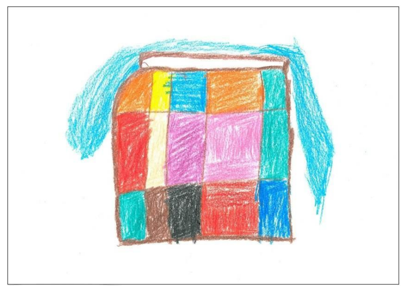
Figure 3 – Girl Somalia

The theme of Sport as a spectator has connections to global sport, but as something that others are doing. This theme was only represented by girls who cannot participate in sports and are aware of that proscription. They cannot present themselves in the limited clothing worn by most girls participating in sports. In these drawings, a girl's opportunities to experience the life-world of sports is limited; to avoid participation, or explain the lack of it, they refer to an injury or sickness.