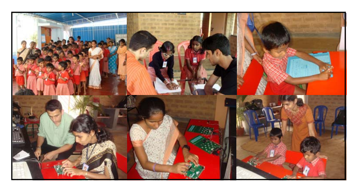
Figure 3: Field Tests at the Mathru School in India