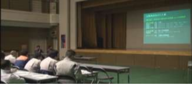
Picture2. Appearance of verification association

they have not discussed with each other about cooperation.