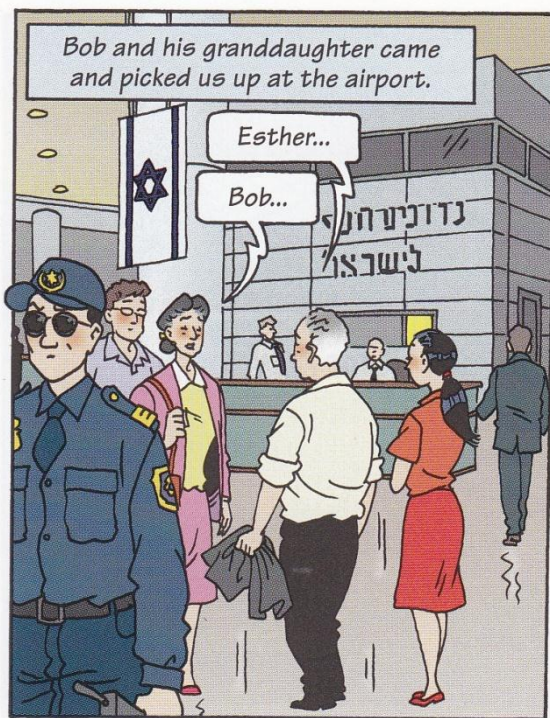
Fig. 3 An airport in Israel (in The Search , p.31)

Yet simultaneously, students are addressed – and constituted – in the accompanying materials within a frame of human rights. The materials provide precisely the link to question the white, heterosexual matrix. Particularly in Germany, where the Holocaust was traditionally taught as part of students’ own heritage of being implicated in the annihilation ( Vergangenheitsbewältigung ), but which now has a large proportion of ethnic minority students who cannot be engaged in this way (see Task Force for International Cooperation on Holocaust Education, n.d.), stressing the contingency of this link can shift the terrain on which the Holocaust is taught and what it means to young people from diverse backgrounds. Holocaust education then becomes neither a straightforward teaching of specific historical knowledge, nor a moral code imposing American values, but a means by which young people with a minority background (whether through immigration, ‘ethnicity’, sexual orientation or other social relations and practices) can claim their particular right to a better life in terms of universal rights (see Laclau 1996).