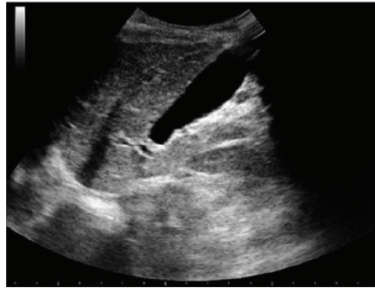
FIGURE 1: Hepatic ultrasound showing a distended gallbladder.

Our experience confirms that congenital cystic duct stenosis can be treated conservatively. Supportive medical treatment has so far been effective in helping the child