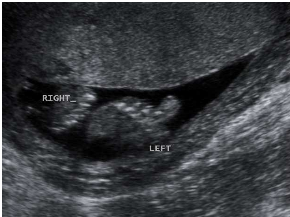
Fig. 1. Ultrasonographic scan of the fetus at 24 gestational weeks demonstrating the difference in size between two second toes. Macroductyly of the left second toe is confirmed by comparable measurements. This is another image of the same case presented in 'Prenatal diagnosis of isolated macroductyly' in Ultrasound in Obstetrics and Gynecology 2009; 33: 360-362.