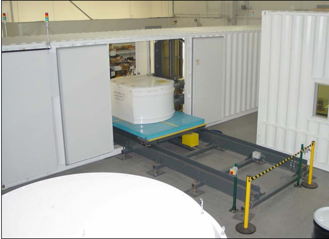
Fig. 2. BSGS assay of an SWB container

sized container, is a compromise between the size of the container, the time allotted for the total measurement, and the statistical precision desired at each measurement position. The container passes through two counting stations; a passive emission measurement takes place at one station, and a ^{60}\text{Co} transmission measurement takes place at the other, with the container stationary during each measurement. Figure 2 shows the BSGS in the process of assaying an SWB container.