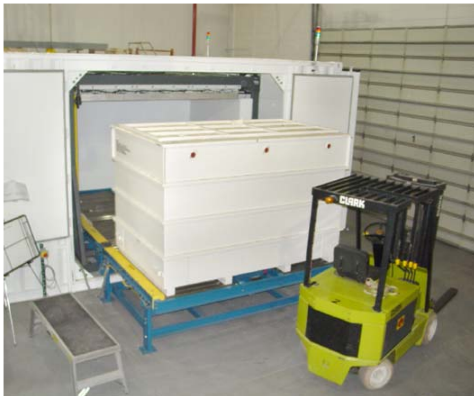
Fig. 4. BNAS general layout.

201cm tall (10' x 6.8' x 6.6' ) with the height being measured from the top of the conveyor, and so can accommodate an SLB-2 container comfortably. The internal height was set by the dimension of the TDOP container. In order to ensure that the container is centered in the assay cavity, guide bars are installed on the sides of the conveyor, and for the smaller containers a loading palette is used.