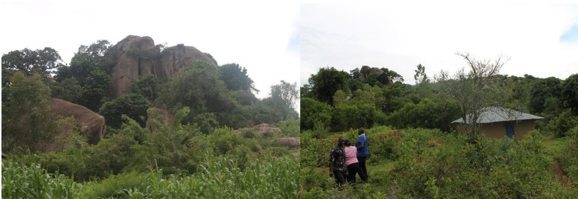
Plate1: Abindu Site Plate 2: Researchers Observing Human Encroachment at Abindu

Abindu site is located in Western Kenya region, particularly the Lake Victoria Basin, a region that relies on agriculture which has been the mainstay economic activity but is facing adverse effects of climate change (Republic of Kenya, 2010b). Environmental resources are steadily declining, and fish resources are dwindling in the Lake Victoria Basin with expansion of human settlements rendering sustainable livelihood almost impossible to attain (LVEMP, 2005; NEMA, 2006; Kairu, 2001). Tourism sector is recognized to provide sector integration in development, namely; environment, agriculture, manufacturing, wildlife, entertainment, and handicraft; and has potential for moving the economy up the value chain, as well as promote environmental conservation, and generate employment and wealth (Republic of Kenya, 2010b). To address the constraints facing the tourist sector and upscale in 'niche' products such as culture and nature artifacts, it is significant to promote ecotourism. Ecotourism is emerging as an alternative development path that can enhance environmental conservation, promote preservation of cultural heritage as well as provide an alternative source of sustainable livelihood (Weilin & Svetlana, 2012; Hayombe, 2011; Honey, 2008, Goma, 2007). Currently, Abindu site is still revered as sacred, though there is a lot of encroachment by human settlement hence the need for its proper management and conservation for future generations (Plate 1 & 2).