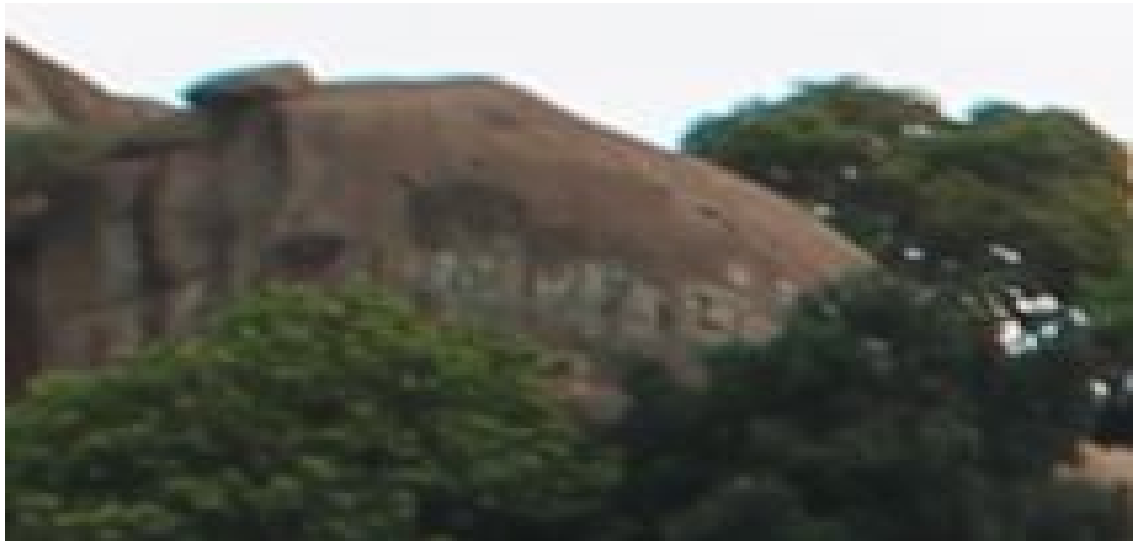
Plate 12: Rock Engravings at Abindu Site

AbuorAdett then pointed at the person who had stolen the jembe and directed the students to check the suspect's bedroom where the stolen property was recovered.