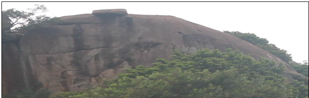
Plate 13: Abindu Rock Art