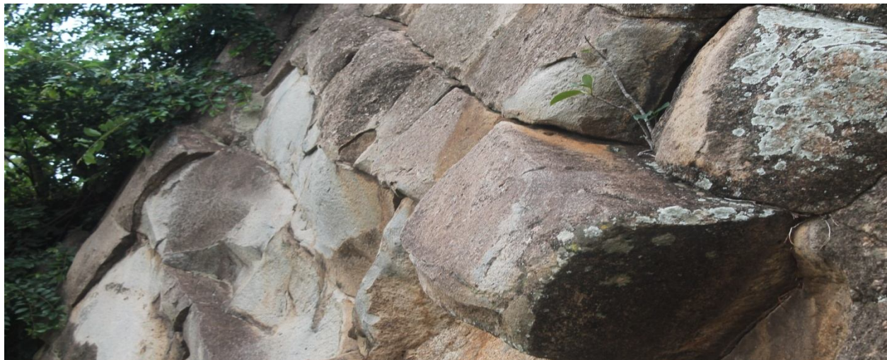
Plate 9: Rock Surface with the 12 loaves of Bread

The religious significance of the site is underscored by the presence of spiritual inscription of the 12 loaves of Bread that is symbolic of Jesus reference to the bread of life (Plate 9). The symbols tend to connect the site with the River-Lake Nilotic migratory route from Southern Sudan. It further points to a possible interaction with the Jewish community where the religious traits were borrowed and later moved or imported into Eastern Africa.