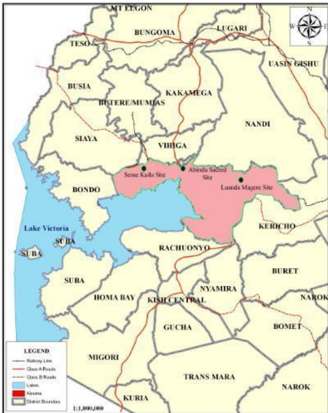
Fig. 2: Location of Abindu site in Kisumu County, Kenya