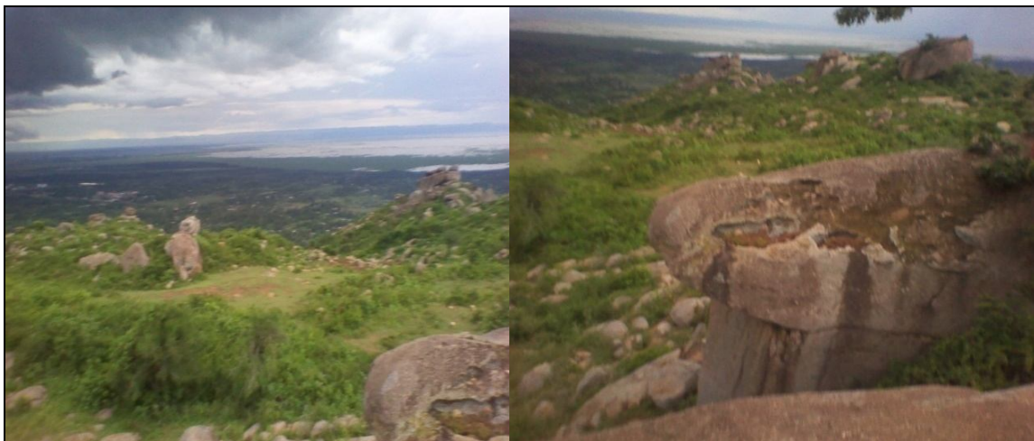
Plate 7: Scenic view of Lake Victoria Plate 8: Engravings on the Massive Abindu Rock

Power Plant as well as the prominent Nyabondo Plateau at the end of Kano and Nyakach Plains (Plate 8). The great Got Huma in South Nyanza is very clearly seen. Abindu has best site for a recreation facility such as a picnic resort or eco-lodge.