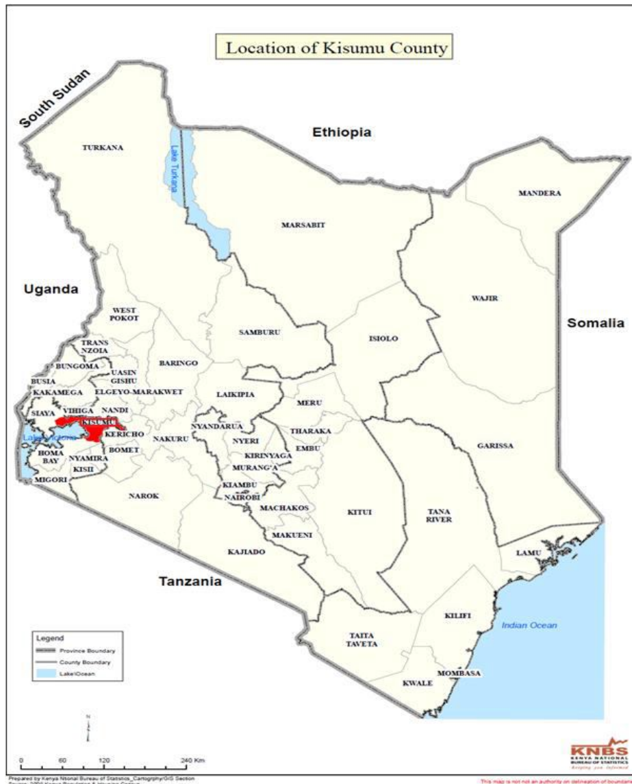
Fig. 1: Location of Study Area in Kenya

Abindu site can be accessed from Kisumu through Busia Road off Darajambili junction to Ulalo road that stretches 2½kms to the site (Route C86). The site can also be accessed from Kisumu through Kakamega Road off Darajambili road through Ulalo–Wachara road (Fig. 2). The site measures approximately 12km square and is surrounded by dense thicket of canopies.