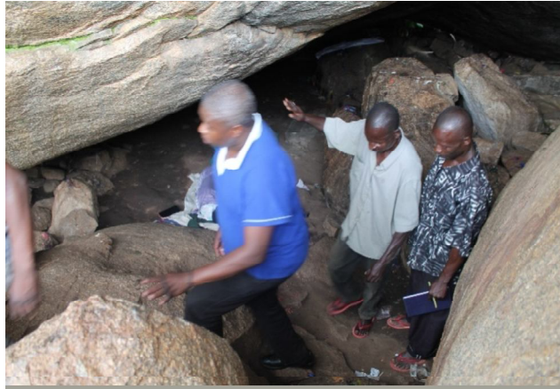
Plate 4: Researchers and resource persons Inspecting the Shrine

The primary data was organized into thematic areas using content analysis. Nachmias (2009) defines content analysis as any technique for making inferences by systematically and objectively identifying specified characteristics of messages. Kothari (2009) further argues that content analysis consists of analyzing the content of documentary material such as books, magazines and the content of all other verbal material which can be either spoken or printed. Content analysis has been qualitatively used in analyzing primary data. Qualitative content analytical approaches focus on analyzing both the explicit or manifest content of a text as well as interpretations of latent content of texts, that can be interpreted or interpolated from the text, but is not explicitly stated in it (Granhein & Lundman, 2004). In the current research, analysis and interpretation of data was done to develop thematic areas as per research objectives using software called NVivo.