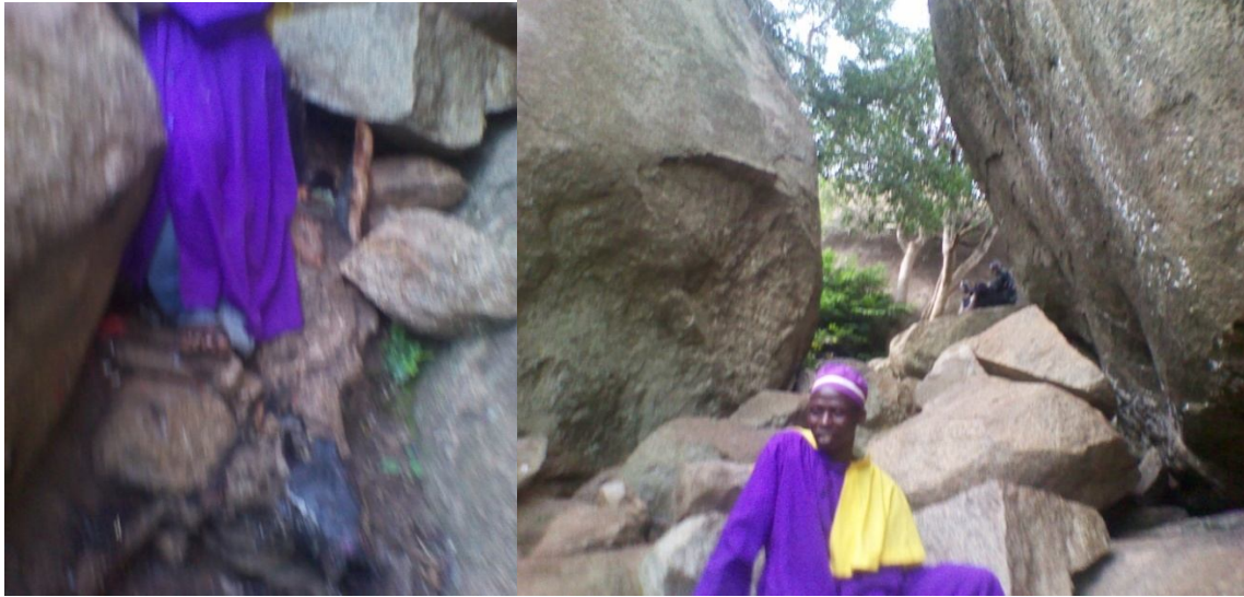
Plate 10: IncenseBurnt at Abindu Shrine Plate 11: Entrance into historical fort at Abindu