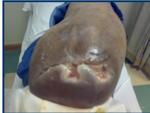
Fig (3.b) the same case, 6 weeks after application of shock wave therapy.