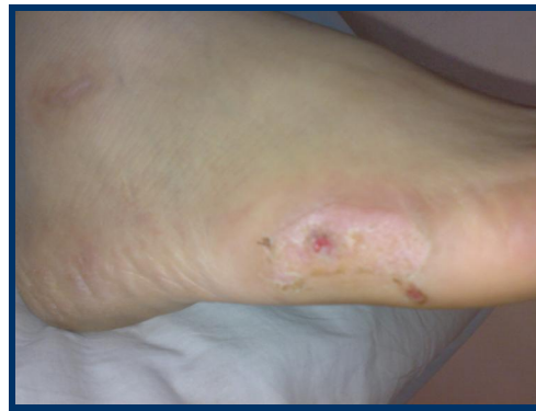
Fig (4.b) the same case after 12 weeks of shock wave application.