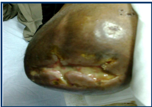
Fig (3.a) (diabetic male patient (60 y) with 4 months unhealed wound due to un-proper fit prosthesis after below-knee amputation) before the treatment with ESWT.