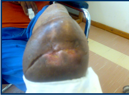
Fig (3.c) the same case, 10 weeks after application of shock wave therapy.