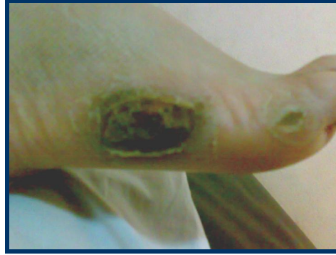
Fig (4.a) diabetic male patient (57y) with 3 months right lateral foot pressure ulcer before the treatment with shock wave therapy.