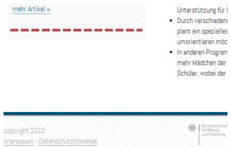
Figure 4: In one of the x-browsers, the calendar widget is rendered in principle, but with a height of 0. Here, WEBMATE draws a line to indicate the invisible widget's position.

quality we avoid to report consequential errors. For instance, if a container element is misplaced, all the contained child elements would be misplaced as well. Therefore, before we check those child elements, we normalize their position relatively to the parent container; only then, we compare the relative positions of each child.