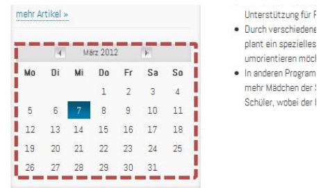
Figure 3: Calendar widget properly rendered in the reference browser. WEBMATE highlights the correct boundaries of the widget to make comparison easier for the developer.