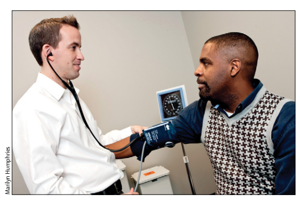
Figure 2: A doctor examines a patient at Fenway Health, Boston, MA, USA

dependent users. Motivational interviewing, cognitive behavioural therapy, and couples' therapy have been empirically assessed as treatments for alcohol-misuse disorders in MSM.<sup>106,107</sup> Because data suggest that many MSM presenting for alcohol treatment also have comorbid drug-misuse disorders, culturally tailored interventions specific to the needs of MSM are needed.<sup>108</sup> Similarly, few gay-specific interventions for tobacco cessation have been assessed for effectiveness. Evidence shows that MSM have a stronger preference for gay-specific smoking cessation programmes than for non-tailored approaches.<sup>109</sup> Social marketing campaigns aimed at raising concerns about tobacco-related harms in the LGBT community are increasingly prominent.<sup>110</sup>