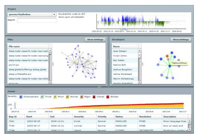
Figure 1. Tesseract user interface

Tesseract analyzes different project archives, such as change management systems, issue repositories, and