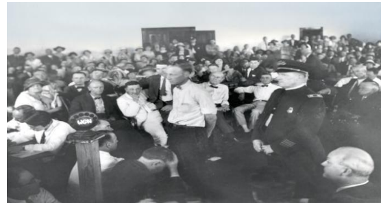
{Scopes stands to speak during the trial as Bryan, Malone, and others listen; }