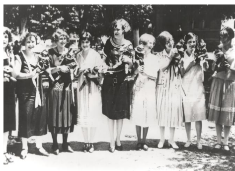
{Dayton ladies posing with their monkey souvenirs from the trial}

deployed as weapons in a larger battle over the evolutionary direction of the 20th Century American nation. As a "hinge" point (NCDPI, 2010) in American history, the Scopes trial is an essential topic for helping secondary students understand origins of modern issues and generate connections to ongoing dialogue among religious, economic, social, and political factions in contemporary society. Moreover, the Scopes trial serves as a meaningful source for exploring the roots of political sensitivity and debate over textbooks as well as the question of academic freedom among educators.