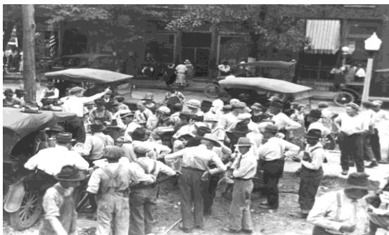
{A crowd gathers to hear a street preacher in the hot July weather during the trial; photo courtesy of Bryan College Archives}

The proceedings began with an overflow crowd (historical estimates claimed 1000 people attended, but contemporary scholars suggest 600-700 is a more accurate estimate) jammed into the Rhea County Courthouse on a stifling July morning. Judge Raulston began the trial, and each morning following, with a prayer from a local minister against the objections of Darrow. The initial day of the affair proved uneventful. Following the selection of the jury, court was dismissed for the weekend. Dayton was buzzing with excitement as everyone anticipated the formal arguments to begin on Monday.