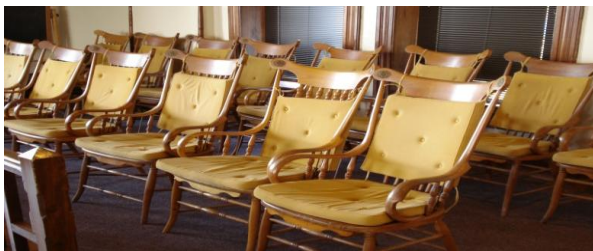
{the original chairs from the jury stand used throughout the Scopes Trial; }