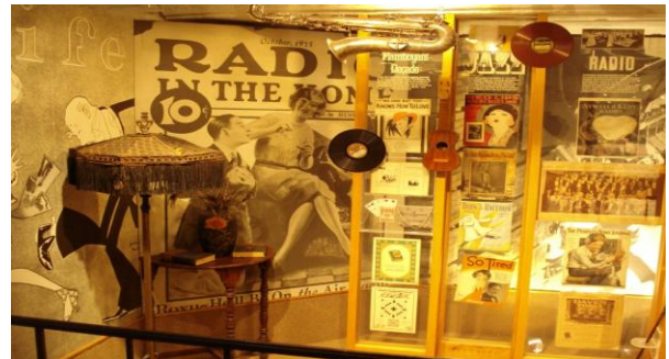
{photo of exhibit in the Scopes Trial Museum, Rhea County Courthouse detailing music from the time of the trial; }

traditional values. Epitomized in the recently passed (1919) eighteenth amendment to the Constitution which prohibited the "manufacture, sale, or transportation of intoxicating liquors", this struggle did not remove alcohol or "social ills" from America, just from public view. The "underground" alcohol trade soon spurred a growth in organized crime and illegal manufacturing (bootlegging) of the banned spirits. In addition, women began to cut their hair in a short bob and shortened their skirts as they listened to the lively music of the era such as California, Here I Come.