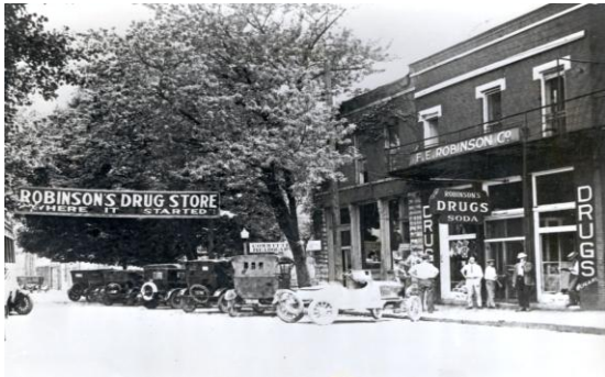
{scene from the street during the Scopes Trial}

The summer sun offered little relief as the town prepared for the big event. As the temperature hovered near one hundred degrees, visitors arrived, filled up the Aqua Hotel, and bought souvenirs from street vendors. Ice trucks began selling blocks of ice to combat the heat in the shadows of street performers and preachers who were shouting to anyone who would listen. The trial, as predicted, had attracted widespread media attention and brought in big profits for local businesses. Over two thousand newspapers carried the events of the trial and for the first time ever, the court proceedings were broadcasted by station WGN of Chicago to radios across America.