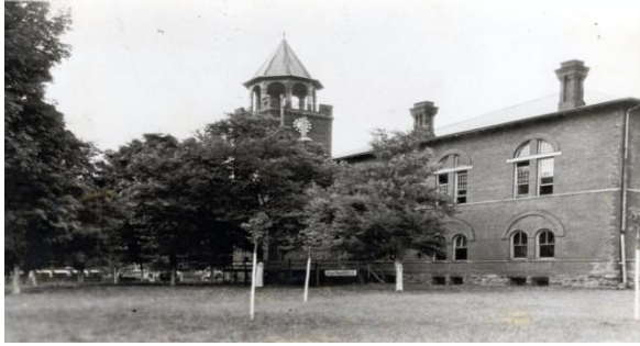
{photo taken from the Northwest corner of the property showing the Rhea County Courthouse; circa 1925}