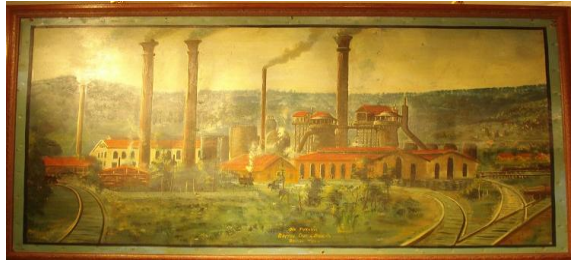
{portrait of the Cumberland Coal and Iron Company in the Scopes Trial Museum, Rhea County Courthouse; }

nation. Dayton, Tennessee – a sleepy little town nestled in the Cumberland Mountains – was in the midst of some difficult times, both economically and socially. At the end of the nineteenth century, Dayton had a population of