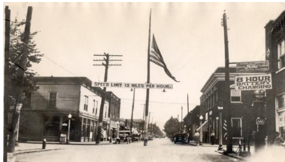
{looking North on Market Street near the Main Street intersection of Dayton, TN; circa 1925}

Language Arts and Literacy in History/Social Studies, Science, and Technical Subjects (see http://www.corestandards.org/the-standards/english-language-arts-standards ). This will occur as students compare genres of literature, including historical fiction, memoirs, primary accounts, and informational/non-fiction in the quest to uncover the facts related to the case. Students can read accounts for author bias and compare varying newspaper accounts (Northern vs. Southern newspapers) of the same events. They may also be interested in reviewing the work of the many political cartoonists who covered the trial, especially Edmund Duffy. Finally, students can analyze how the media covered the trial, including news reels that were shown in theaters across America, the first national broadcast of a trial (by WGN in Chicago), and stories from the myriad of print media (over 2100 newspapers sent reporters) that emanated from Dayton in the sweltering heat of July 1925.