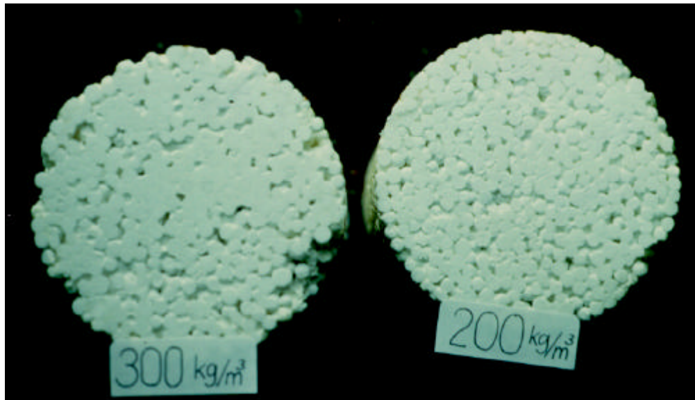
Fig. 2: Gypsum composite samples with different densities