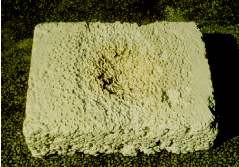
Fig. 3: Behaviour of gypsum-polystyrene foam composite against fire

samples. In an experiment conducted under laboratory conditions, 6 samples, 40x40x10 cm, were exposed to open fire and has been observed. After half an hour, the polystyrene foam beads on the surface of the blocks which had direct contact with fire, evaporated without burning, and the surface temperature of the samples did not exceed 30 °C. According to these results, gypsum panels of 10 cm thickness and with a density of 500 kg/m 3 have the ability to retard fire for half an hour.