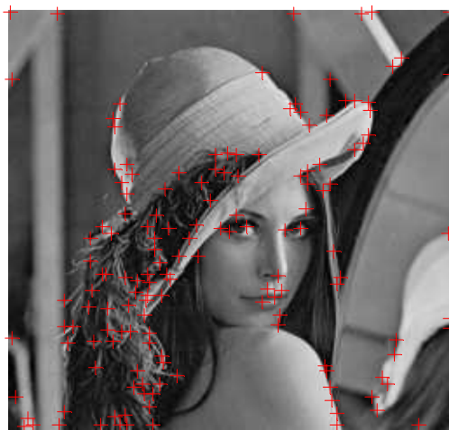
Fig. 2 The detected effect of Harris Operator

The original image used in this experiment is the classic Lenna image in digital image processing. Separate using the Harris detection algorithm on Lenna image, the detected effect is shown in Fig. 2: