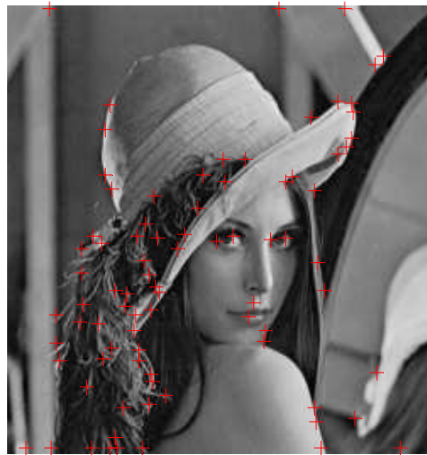
Fig. 4 The detected effect of improved algorithm

Use the improved algorithm that's put forward in this paper to process this image, the effect is shown in Fig. 4: