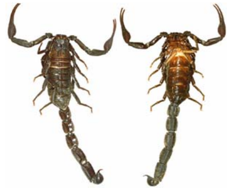
Figure 5. Hottentotta zagrosensis

DISTRIBUTION: Iran (Kovařík, 1997a: 41), Koozestan, Chahrmahal&Bakhtiyari, Kohgiluyeh & Boyreahmad and Fars provinces. (Navidpour et al. , 2008a, 2008d, 2012, Pirali-Kheirabadi et al. 2009.