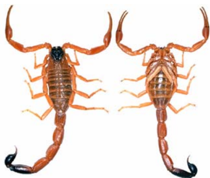
Figure 3. Hottentotta saulcyi

In Iran: from Koozestan, Lorestan, Chahrmahal & Bakhtiyari, Kohgiluyeh & Boyer-Ahmad, Bushehr, Fars and Ilam provinces (Navidpour et al 2008a, 2008b, 2008c, 2008d, 2010, Pirali-Kheirabadi et al 2009).