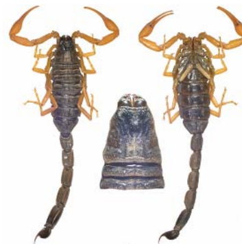
Figure 7. Hottentotta lorestanus

fixed fingers, with 13 MD rows. Mesosomal sternite VII smooth, with 4 smooth carinae. Metasomal segments I to III with 10 carinae; segment IV with 8 carinae and segment V with 5 carinae, 3 ventral (1 median, 2 lateral) and 2 dorsal. Dorsal carinae of metasomal segments bear terminal granules of size approximately equal to pre-ceding granules. Dorsal surface smooth. All metasomal segments longer than wide. The described features distinguish H. lorestanus from all other species of the genus. They are recounted in the key below. Together with H. khoozestanus Navidpour et al., 2008, H. saulcyi (Simon, 1880), and H. schach (Birula 1905), the new species is among the largest in the genus. H. lorestanus can be easily distinguished from H. khoozestanus Navidpour et al., 2008 by its nearly entire body being hirsute. H. lorestanus can be easily distinguished from the other above named three species by coloration; whereas only H. lorestanus has pedipalps entirely yellow ( H. zagrosensis has pedipalps entirely black, and H. schach has a black chela of pedipalps) and metasomal segments I to IV are greenish grey (in H. saulcyi , these segments are yellow).