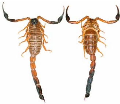
Figure 4. Hottentotta schach