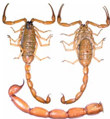
Figure 6. Hottentotta khoozestanus

The described features distinguish H. khoozestanus from all other species of the genus. They are recounted in the key below. Together with H. saulcyi (Simon 1880) and H. schach (Birula 1905), the new species is among the largest in the genus. The last species hitherto described from Iran is H. zagrosensis Kovařík, 1997. H. khoozestanus can be easily distinguished from the above named three species on two characters: (1) Hairless pedipalps and metasoma, which in the other three species are densely hirsute. And (2) coloration; whereas H. khoozestanus has the fifth metasomal segment and telson yellow, in the other three species those parts are black ( H. zagrosensis is entirely black).