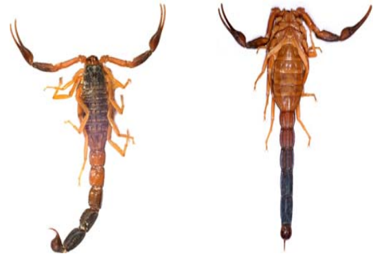
Figure 2. Hottentotta jayakari

In Iran: Hormozgan province (Farzanpay, 1988)