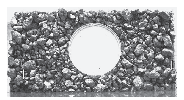
Figure 1. Experimental terrarium containing a dish with water surrounded by pebbles, simulating riparian conditions. The two spiders are indicated by arrows.