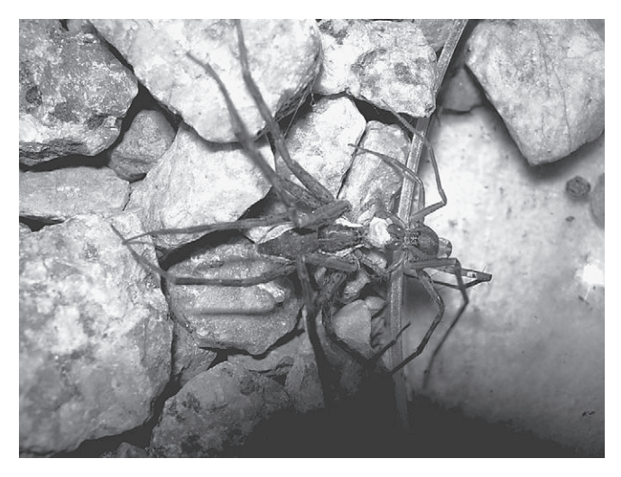
Figure 3. Female (left) and male (right) in the face-to-face position grasping the gift, during mating.

The presence of nuptial gifts in P. ornata enhanced male mating success and increased copulation duration, in agreement with reports for gift-giving insect species (Sakaluk 1984; Thornhill 1976b; Simmons & Gwynne 1991; Vahed 2007). Our