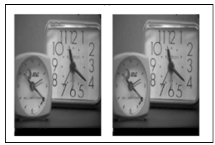
Fig. 3: Normal and Proposed Image Fusion