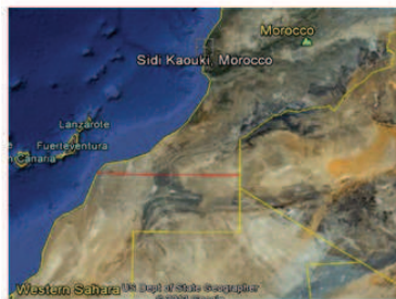
Figure 1. Collecting sites

The zoological material brought to the laboratory of our faculty comes from both lagoons and intertidal areas but also from desertic zones from Northern Africa.