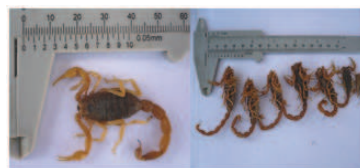
Figure 3. Buthus occitanus

As regarding the scorpions, Buthus occitanus (Figure 3) represents a new species for our teaching collection, which contained till now one specimen of Euscorpium carpathicus and another one of Pandinus sp.