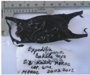
Figure 6. Raja clavata egg from Cap Sim