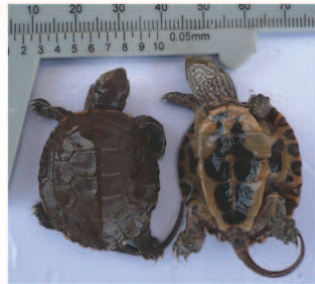
Figure 4. Mauremys leprosa specimens

New reptiles for our teaching collections are: the turtle Mauremys leprosa (Figure 4), the gekkonids Saurodactylus , Stenodactylus and also the agamid Trapelus (Figure 5, from left to right). The first shark egg of the collection dates from Dakhla expedition and belongs to Raja clavata (Figure 6).