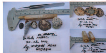
Figure 2. Molluscs from Morocco

The barnacles ( Balanus sp.) are attached to molluscs like limpets ( Patella sp.) and top snails (Trochidae) (Figure 2). Before achieving those complete specimens of Patella (with muscular foot) and Solen (with both valves still connected, leg and siphons exposed), our collection resources were based solely on dry empty shells of their kind. The reigning notion is that animals collected alive are the most beautiful of all (Bruyne, 2004).