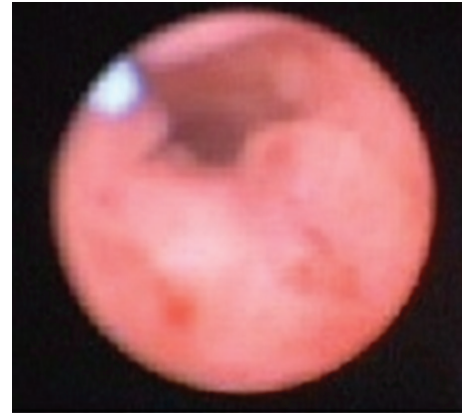
FIGURE 2: View of the ureter before intraurethral BCG treatment.

Cryotherapy is a technique that employs intensely low temperatures to eliminate the diseased tissues. For this purpose, solid carbon dioxide (dry ice) at -78.5^{\circ}\text{C} or liquid nitrogen at temperatures up to -190^{\circ}\text{C} are used. The gas that is to be used in the freezing process is passed through the probe and causes the probe to cool excessively. When the gas used in the cooling process is pushed toward the end of the probe, the volume of the gas instantly expands, and as it absorbs heat from the environment, the probe end is cooled. The cell death is provided by the transformation of the pure water in and out of the cell into ice crystals.