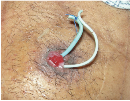
FIGURE 1: View of the ostomy before cryotherapy.

iliac lymph node dissection following a positive test result of transurethral resection-bladder (TUR-B) pathology for a low-grade urothelial carcinoma with muscle invasion. Perioperative ureter lower end frozen examination revealed no tumor at the lower ends of both ureters. The tumor's pathological stage was pT2N0M0 (urothelial carcinoma, high grade, positive for muscle invasion, and bilateral (right: 11, left: 7) reactive lymph nodes). He began and routine followup after the operation. Urinary cytology was class 2 at the postoperative 3rd-month control and class 4 at the 6th month; his urinary cytology was repeated, and the test result was reported as class 5. Furthermore, his physical examination revealed a hyperemic and edematous area that was tuberous at the site of the urostomy (Figure 1). The patient was asymptomatic. No pathology was evident in imaging examinations.