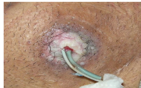
FIGURE 3: View of the ostomy following cryotherapy.

According to these principles, the patient underwent 4 courses of cryotherapy of 30–70 seconds with a double cooling-thawing cycle, and it was observed that the tumoral lesions at the cutaneostomy site regressed to skin level. At the mid-term evaluation, it was decided to continue the cryotherapy. After observing that the patient's lesion completely recovered as a result of 9 courses of cryotherapy, a few punch biopsies were taken from the cutaneostomy region (Figure 3).