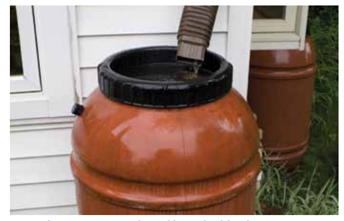
Captured rainwater can provide a viable supply of the often scarce resource. Among other sources, Singapore has developed rainwater diversion and re-uses treated water. Fully 98 per cent of all Israeli rainwater is put to practical use

Specifically, Beijing has restricted or relocated high water-consuming industries (such as power, iron and steel companies) to regions with water surpluses, developed tertiary less-water-consuming industries (such as high-tech and retail) and decreased water use for agriculture by reducing local areas under irrigation through better crop choices and applying a variety of water-saving technologies. As well, Beijing is looking elsewhere for water relief, such as through water supply diversions including the controversial proposed South-to-North Water Diversion