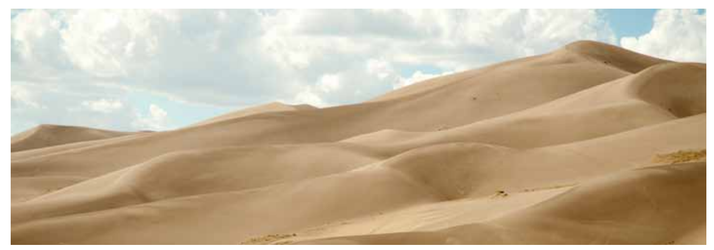
Avoiding desertification: balancing the huge and growing human demand for water with water's crucial role within the natural system will be one of the most pressing challenges of the 21st century

options for mitigation; and (d) preparation of a matrix of problems, critical issues and their potential solutions (World Bank/UNDP/ FAO, 1995).