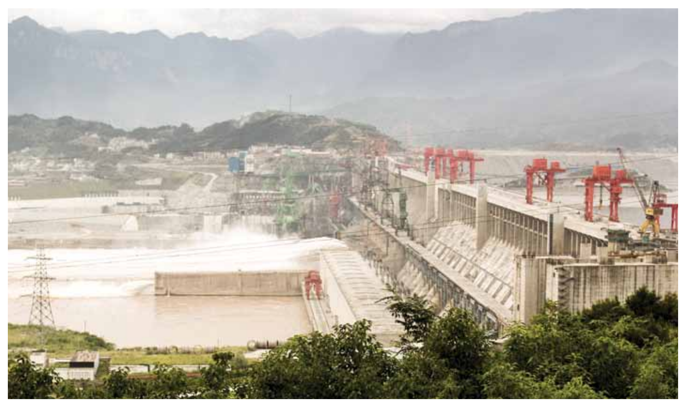
A hydro-electric installation at China's Three Gorges Dam: urbanization can increase a country's productivity and improve living conditions, but these same benefits often translate into enormous demands on water and energy