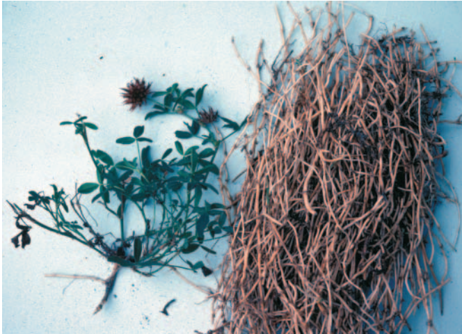
Fig. 4. Springbank clover ( Trifolium wormskioldii ) rhizomes.

taste somewhat like bean sprouts, were pried from sandy soil usually in the fall after the leaves had died back and were tied in bundles and steamed or pit-cooked. They were eaten fresh at family meals or feasts and were sometimes dried for storage or trade (Boas 1921; Turner 1995).