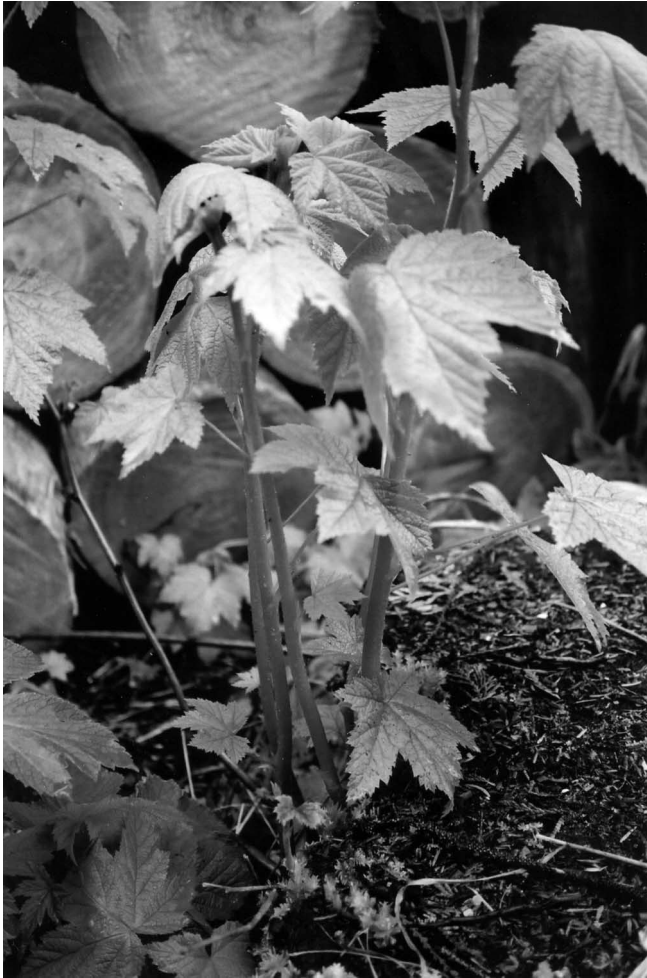
Fig. 7. Thimbleberry shoots ( Rubus cuneifolius ).

times cooked. They were so important that some people held a “First Shoots” ceremony, similar to the more common First Salmon ceremony, to give recognition to the spirits of this plant, so that this food would always be plentiful: