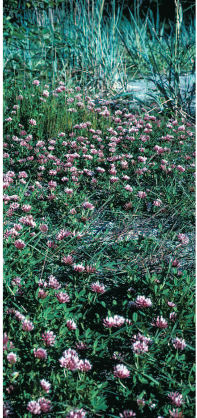
Fig. 3. Springbank clover ( Trifolium wormskioldii ) flowers.

Mentioned previously as one of the foods harvested by the Tsawataineuk of Kingcome Inlet, this clover was a much-favoured root vegetable all along the northwest coast (Edwards 1979; Kuhnlein et al. 1982; Turner and Kuhnlein 1982; Turner 1995; Deur and Turner 2005). It was formerly common along shorelines and in estuarine marshes, often growing together and harvested with Pacific silverweed ( Potentilla pacifica ). Clover Point in Victoria is named after this plant (Turner 1999). The thin, whitish rhizomes, which