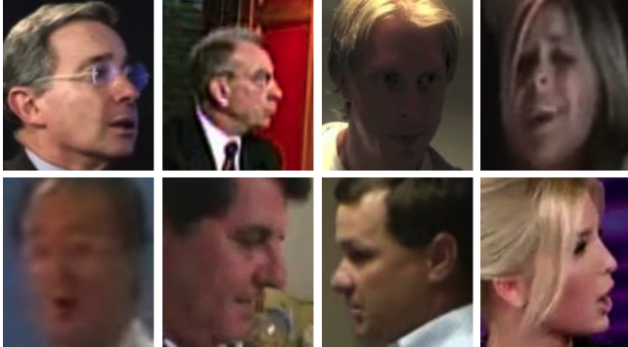
Figure 5. Example images from eight face tracks in the YTF database where all images in that track could not be enrolled by one of the COTS matchers. These images display extreme pose and illumination conditions, low resolution, and motion blur.