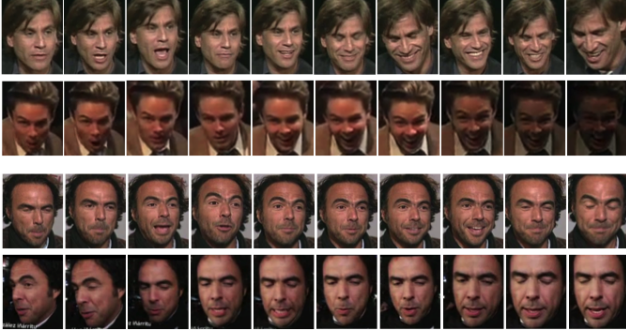
Figure 2. Example images from face tracks of two subjects. Top two and bottom two rows are face tracks from the same subject.

A face track can be represented as a set of images, U = \{u_1, u_2, \dots, u_a\} , where u_i is the i -th face detected/extracted from a consecutive frames of a video. Given two face tracks U and V , each containing a and b faces, respectively, we can apply any static-image face matcher to all frame-to-frame pairs (u_i, v_j) to obtain a \times b similarity scores s(u_i, v_j) . Hence, the comparison of two face tracks results in a similarity matrix S(U, V) . Under the assumption that each face track contains faces of a single person, we wish to recognize if two face tracks represent the same identity. Whether for face identification or face verification, the track similarity matrix needs to be resolved to a single similarity score indicating the overall similarity between the two identities present in the two face tracks.