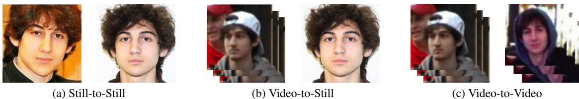
Figure 1. Face recognition can generally be categorized into one of the following three scenarios based on the characteristics of the image(s) to be matched. (a) Still-to-still image matching is perhaps the most common scenario and is used in both constrained and unconstrained applications. (b) Video-to-still image matching occurs when a sequence of video frames is matched against a database of still images ( e.g. , mug shots or driver license photos). (c) Video-to-video matching, or re-identification, is performed to find all occurrences of a subject within a collection of video data. Re-identification is generally a necessary pre-processing step before video-to-still image matching can be performed. In this work, we generate a baseline accuracy using commercial face matchers for video-to-video face matching.

in an attempt to identify the subject (Fig. 1b).