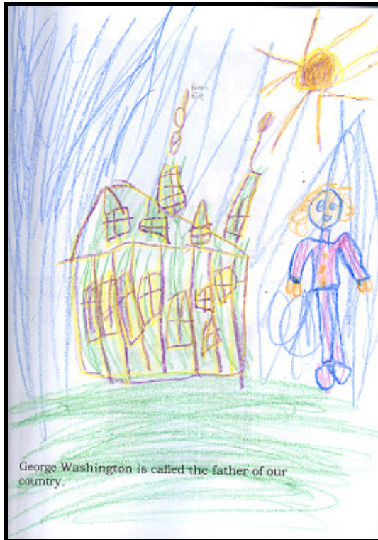
Picture C: A student's historically appropriate picture of George Washington.