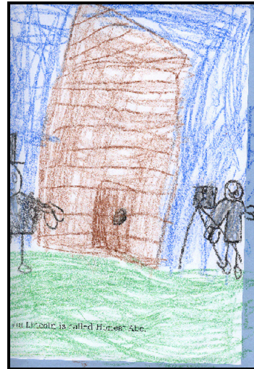
Picture D: A student's historically appropriate picture of Abe Lincoln.