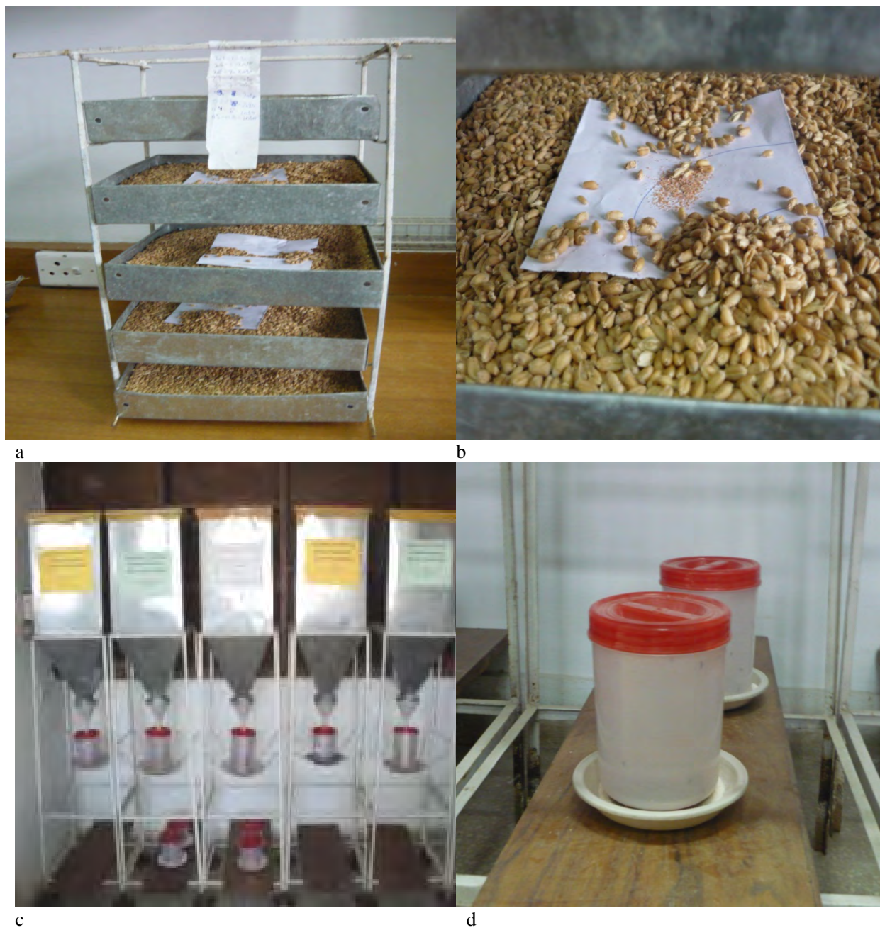
Fig. 1 Rearing of Angoumois grain moth, Sitotroga cereallela (Olivier); step 1: eggs of S. cereallela were released in trays (36×30×5 cm) filled with 5 kg wheat grains, tag showing dates on which eggs were added in the wheat grains: a; eggs of S. cereallela in trays: b; step 2: five mass rearing chambers made up of tin sheets, in which trays filled with 5 kg wheat grains, eggs of S. cereallela were placed in the upper parts of chambers which have two parts: the upper one (37×37×50 cm) was rectangular while lower one tapers downwards with an opening (3×3 cm). An adult collection box was attached to the lower side; the adults were dropped directly into oviposition jars, attached to the lower end of the chamber, were replaced daily with new ones: c; step 3: oviposition jars were placed on starch present in plastic plates, adults laid eggs in starch; the eggs were collected and used for further experiments: d.