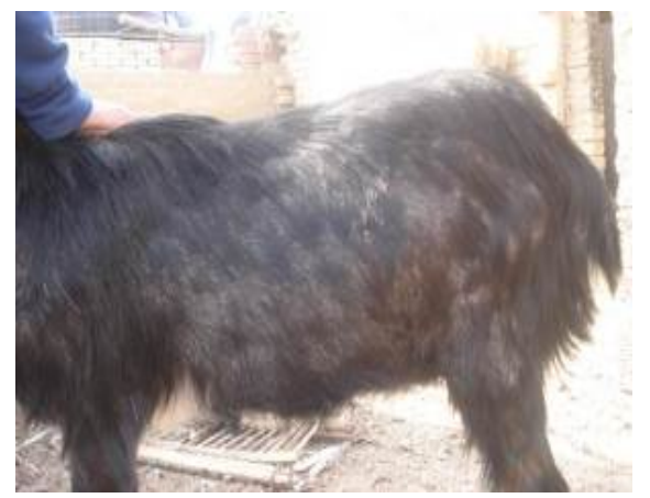
Figure 1. Hypocupremic goat showed hair depigmentation and steely appearance

In conclusion, copper deficiency has a significant role in modulation of immune status and induction of DNA damage and cell apoptosis in goats. Hence, copper level should be strictly considered during formulation of rations in farm animal production practice.