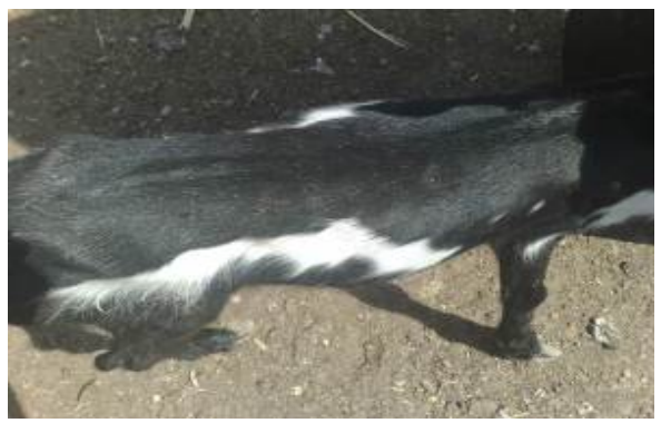
Figure 3. Hypocupremic goat showed emaciation and loss of body condition