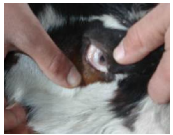
Figure 2. Hypocupremic goats showed paleness of conjunctival mucous membrane