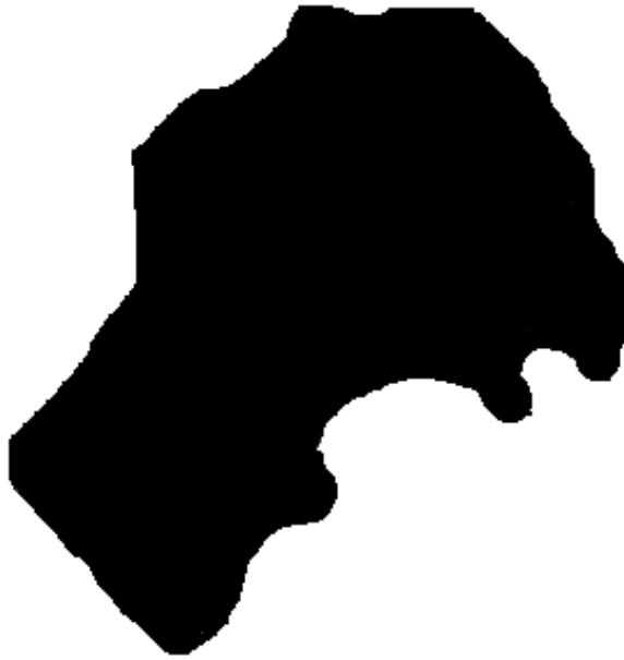
Fig. 1: Photoshop software Preprocessed nucleus

All nuclear images of positive and negative cases were coded. The fractal dimensions of nuclear boundaries by using the benoit version 1.3 software were measured. This software calculates fractal dimensions of nuclear boundary of each image by means of box-counting algorithm (Figure 2).