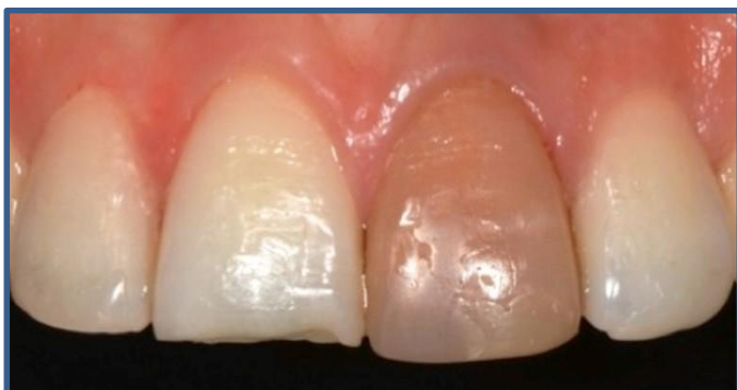
Fig.1: Discolored maxillary left central incisor tooth

A 29-year-old female patient reported to the Federal University of Santa Catarina with a complaint of discolored upper front tooth and desired the discolored tooth be treated [Figure 1].