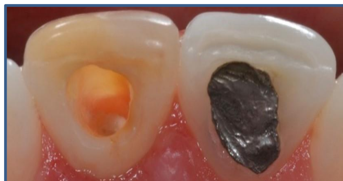
Fig.2: 1mm zinc phosphate cement seal in situ overlying gutta percha at CEJ

Odontológicos, Palhoça, SC, Brazil) and 10% carbamide peroxide (Powerbleaching 10% BM4 Materiais Odontológicos, Palhoça, SC, Brazil). In the second session, after prophylaxis, the patient had the upper arch molded with alginate in order to construct a plastic bleaching tray. For bleaching occurred only on maxillary left central incisor tooth, the tray had the labial surface of the adjacent teeth cropped, therefore the bleaching gel does not come into contact with those teeth. After placing the rubber dam, the obturated material was removed from the tooth up to 3 mm below the cemento-enamel junction using a heated plugger. 1 mm zinc phosphate cement was placed over the gutta-percha as a protective seal (6) [Figure 2].