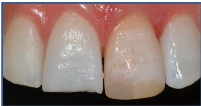
Fig.3: Post bleaching appearance of the discolored teeth

canal orifice; fill the tray reservoir with a pea sized amount of gel; insert the tray over the teeth and remove any excess gel. After 2 hours using the tray, the coronary orifice and the buccal surface were properly cleaned by the patient and a cotton ball was inserted into the pulp chamber. Orientations about the bleaching product and eating habits during the treatment period were given to the patient. The use of the tray with the bleaching gel occurred daily for a period of two hours during one week. After treatment [Figure 3], the canal was sealed with glass ionomer and a final composite restoration was bonded into place 10 days later.