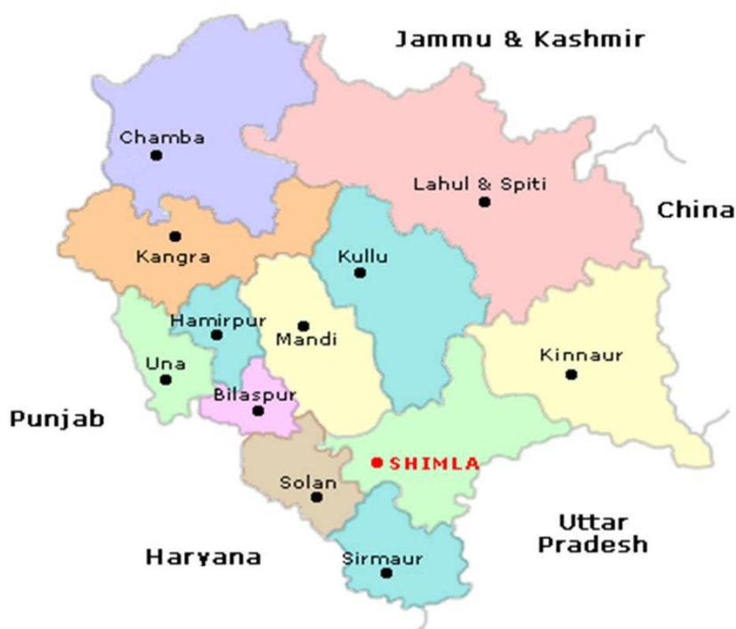
Fig 1 – Map of Himachal Pradesh

This checklist was based on an exhaustive bibliographic survey of the literature published in various national and international journals, monographs, books, book chapters and even magazines on the rust genus Puccinia . A geographical map of the state is provided in order to understand the distribution of the rust fungi in Himachal Pradesh (Fig. 1). Family wise list of susceptible plant host was prepared to assess the host range of Puccinia in the state. Species distribution was assessed on the basis of their occurrence on plant host and their families and their geographical distribution. A brief description on taxonomy and occurrence of this fungus in different regions of the country is also presented. Some species names as reported in the cited publications have been replaced with their currently accepted name according to the Species Fungorum ( www.speciesfungorum.org ) website.