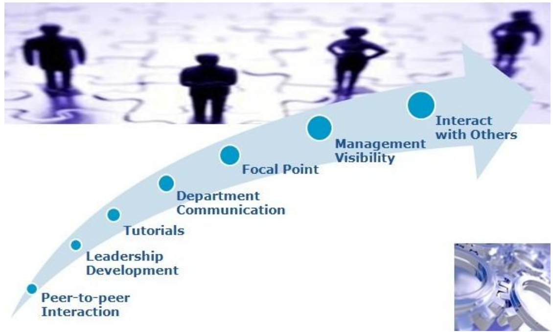
Figure 1. In-House user group benefits.