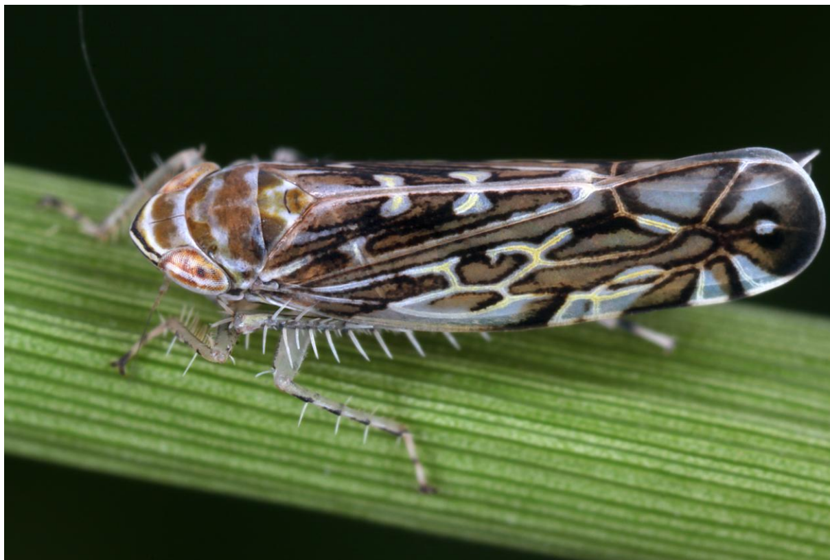
Photo 5: Paralimnus lugens (Horv.), ♂, Adelebsen, 10.VII.2009 (G. Kunz)