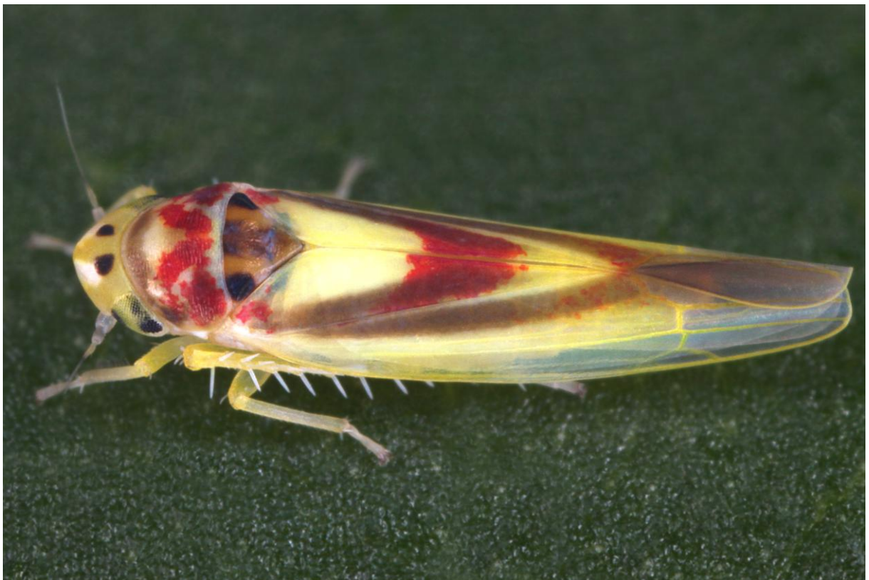
Photo 4: Zygina lunaris (M. & R.), ♀, Lorch am Rhein, 6.VIII.2010 (G. Kunz)