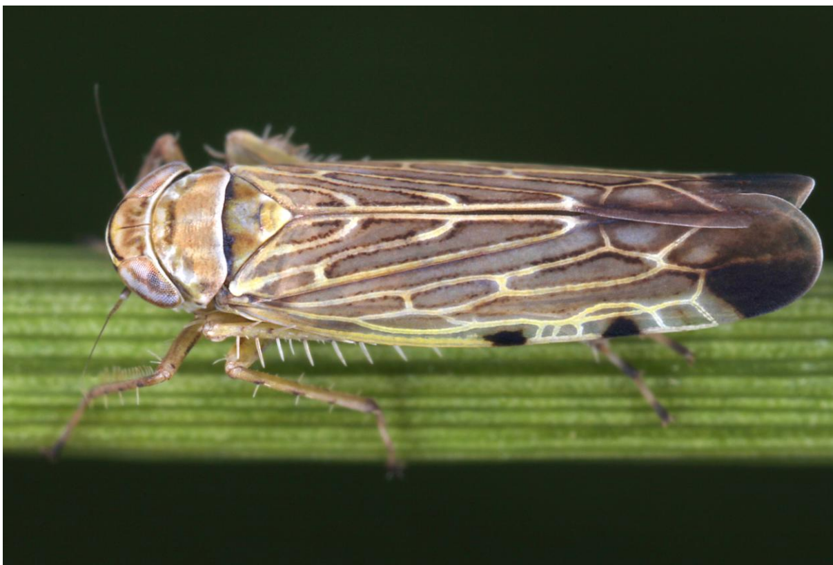
Photo 7: Paralimnus rotundiceps (Leth.), ♂, Gimte, 10.VII.2009 (G. Kunz)