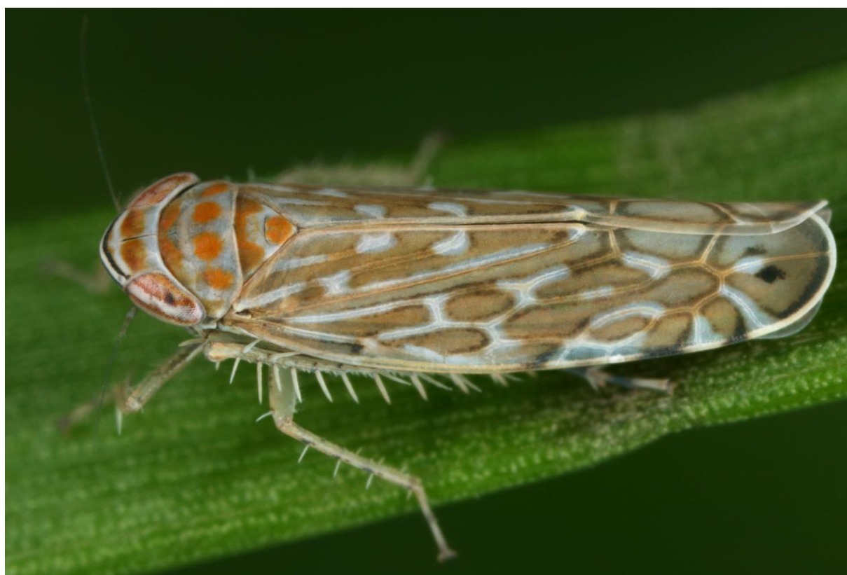
Photo 6: Paralimnus phragmitis (Boh.), ♂, Rabenhof, Styria (Austria), 19.VIII.2007 (G. Kunz)