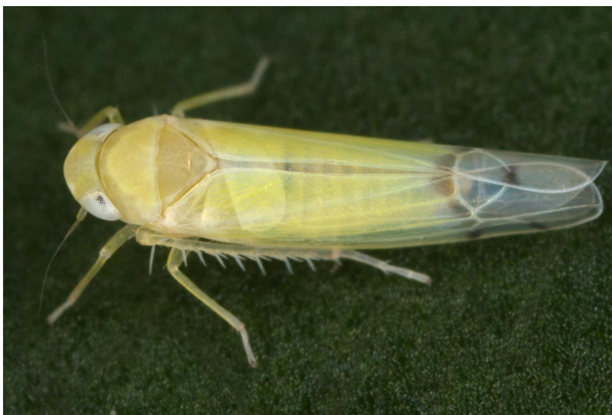
Photo 2: Ribautiana cruciata (Rib.), ♂, Darmstadt, 31.VIII. 2008 (G. Kunz)