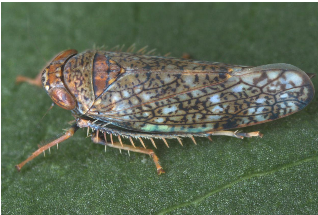
Photo 8: Orientus isbidae (Mats.), ♂, Graz (Austria), 19.IX.2007 (G. Kunz)