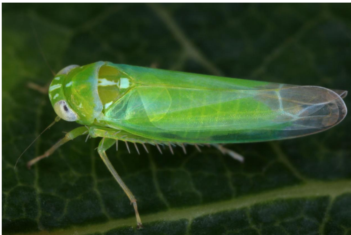
Photo 1: Kyboasca maligna (Walsh), ♀, Gostingen (Luxemburg state), 4.VIII.2010 (G. Kunz)