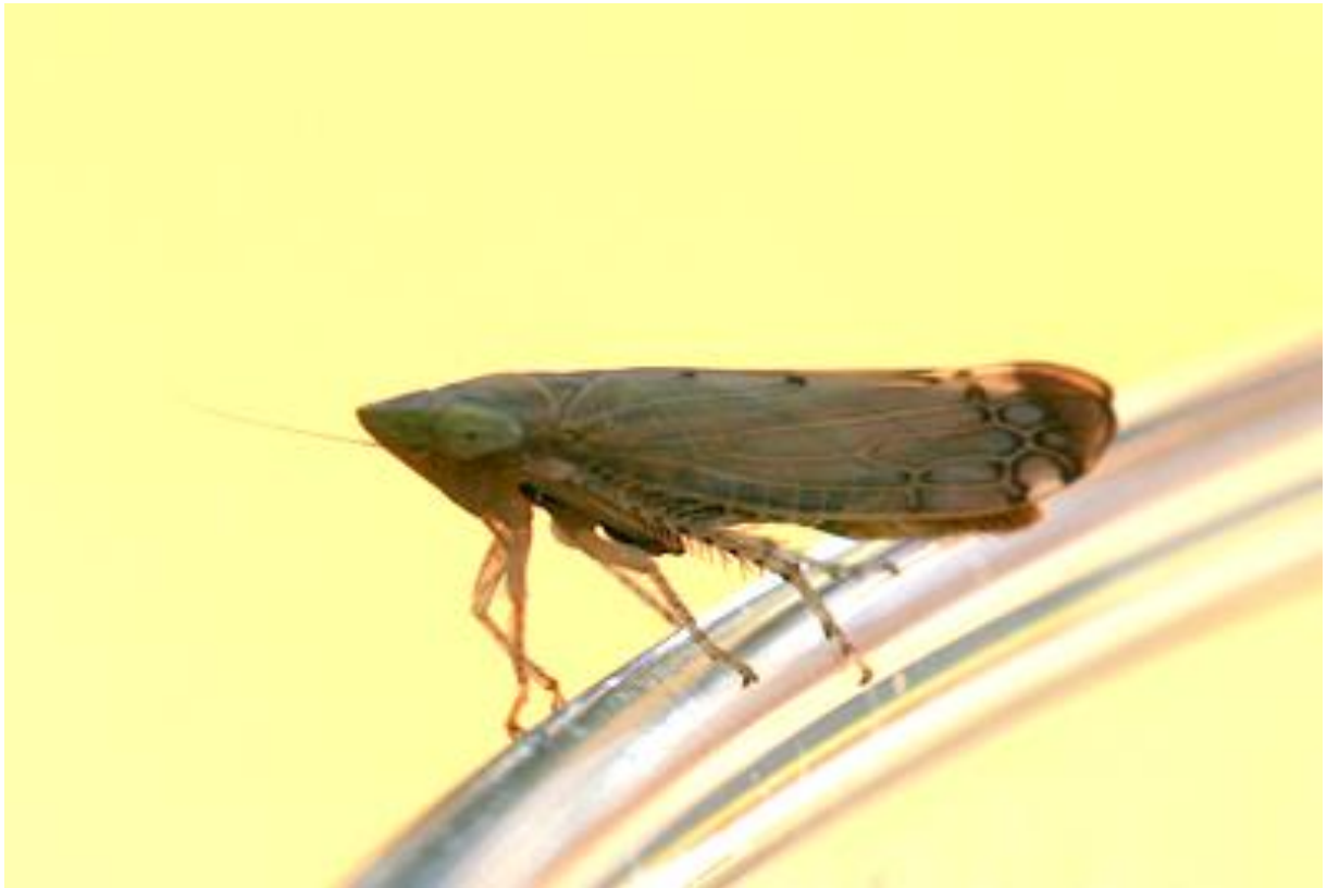
Photo 3: Synophropsis lauri (Horv.), ♂, on a beer glass, Hamburg, Botanical Garden, 13.IX.2008 (R. Ridley)