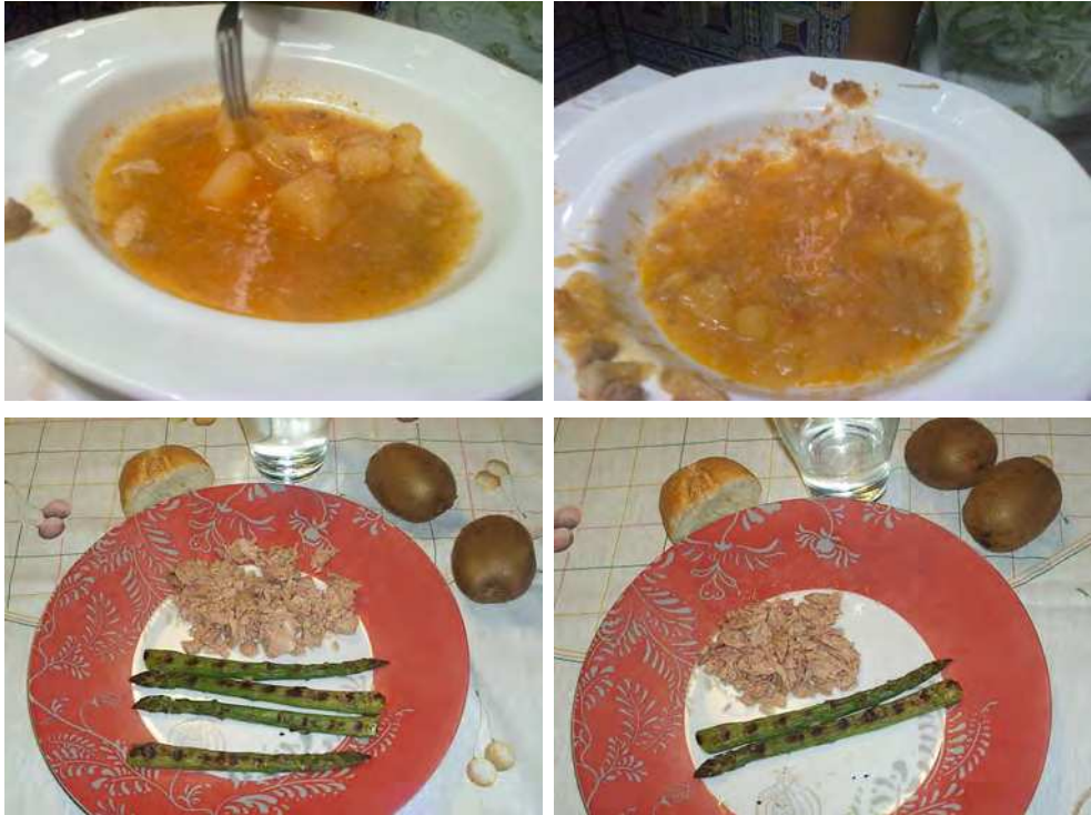
Fig. 1. Patients with anorexia nervosa at the beginning of the treatment. These photos show the served amount of food and the leftovers when patients finish eating.

amounts of food which patients leave with some intention: "I am calm when I leave a little of food on my plate". This is an example of "insignificant details" that parents do not explain to the nutritionist who can detect it by means of the photo. At the beginning of the treatment lots of parents and patients are reluctant to photograph meals; however they change their mind by observing the efficacy of this instrument for the nutritional treatment.