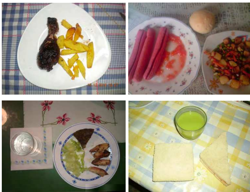
Fig. 3. These photos show that meals' presentation must be included in the nutritional education.

In addition to the demonstrated usefulness to show the real amount of food, the nutritionist can make use of photos to observe the meals' presentation and improve it, if necessary. Eating is an easier task for patients with an appropriate meals' presentation. Taking a meal's photo improves the presentation right from the start because the responsible persons show a great interest in the meals' appearance, given that this photo will see by a person beyond the family. This is one of the consequences of the lack of importance that the nutrition has at present. Generally, people do not pay attention to the meal presentation but this issue has a great influence on the nutritional evolution of patients. Usually, responsible persons for the meal presentation do not take any pain to satisfy the eyesight, which is particularly important for the nutrition of children, the elderly and eating disorders patients. Sometimes, eating disorder patients, as well as a normal person would make, express great efforts to eat given the lack of interest showed by family member responsible for cooking, for example: a meat croquette whose size was equivalent to five normal croquettes since the mother did not like cooking, a burnt omelet or a fried fillet without any previous preparation with eggs, flour or breadcrumbs, that is to say, from the butcher's shop to the deep fryer directly.