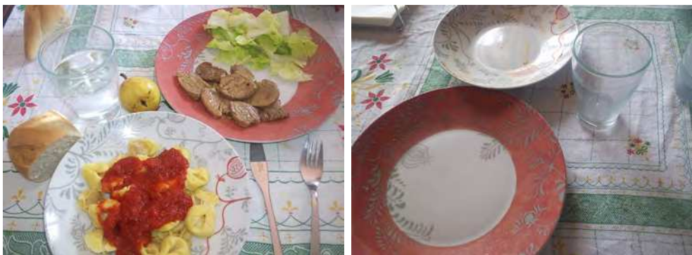
Fig. 2. Patient with anorexia nervosa after six months of treatment.