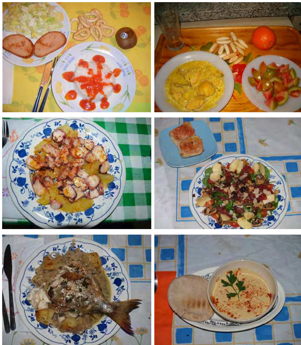
Fig. 4. These photos are the result of the nutritional education. A good presentation eases the nutritional treatment.

Likewise, patients' families forget to mention anomalous eating attitudes of patients which the nutritionist observes in digital photos like crumbling foods, leaving always leftovers, peeling fruits in a particular way, mixing foods (for example the salad with lentils), using out of the ordinary plates and cutlery (anorexia nervosa patients who use small plates and cutlery, for example), among others. Finally, when out-home meals are allowed taking into account the patients' evolution, photos are again recommended to show them. Patients are