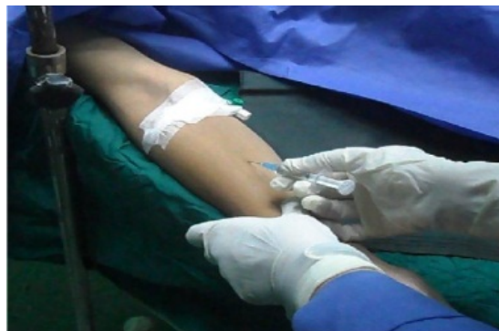
Figure 3. Subcutaneous injection.

One of the major drawbacks to the use of intravenous DCS in compromised airway is the probability of losing patient's cooperation for opening the mouth and to be